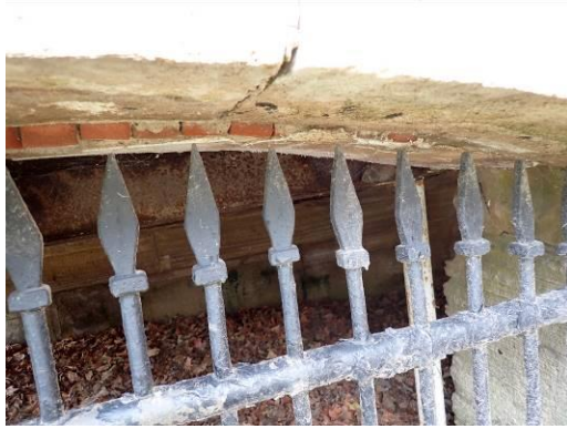
21, 22. Views of cast iron ventilation guard