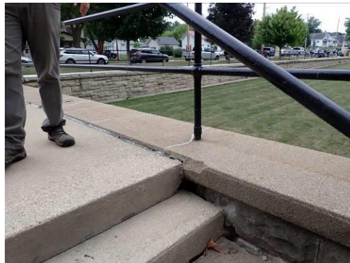
49, 50. Views of stairs to plaza level