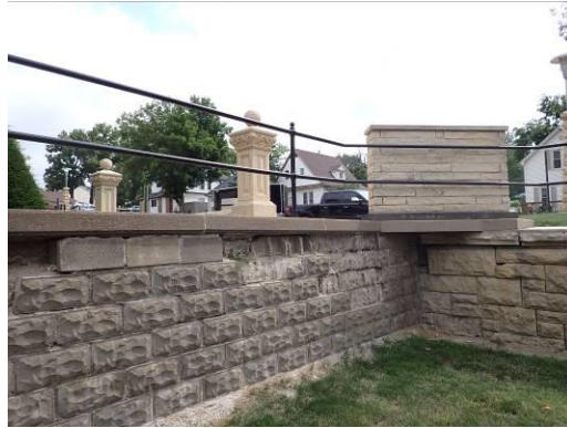
39, 40. Failing retaining walls