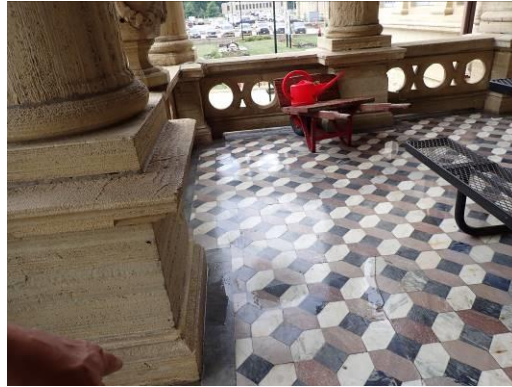
33, 34. Tile flooring