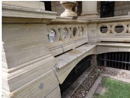
19, 20. View of northeast corner