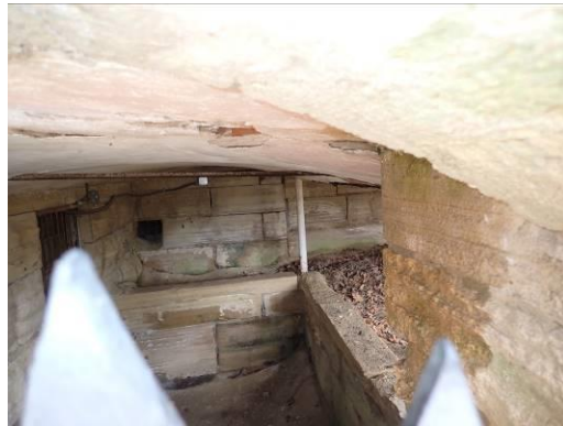
29, 30. Views of the soffit and brick backer