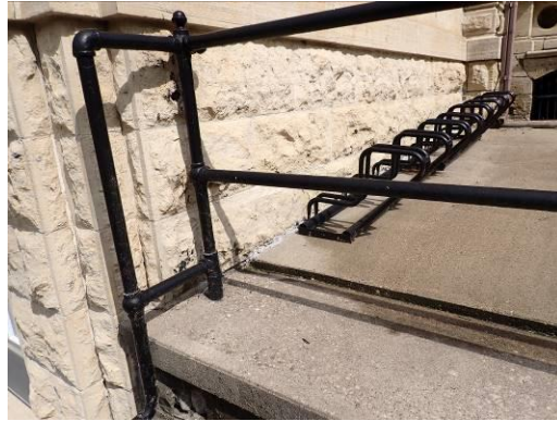
45, 46. Views of sidewalk above wall