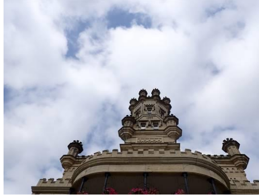
3, 4. Views from the east