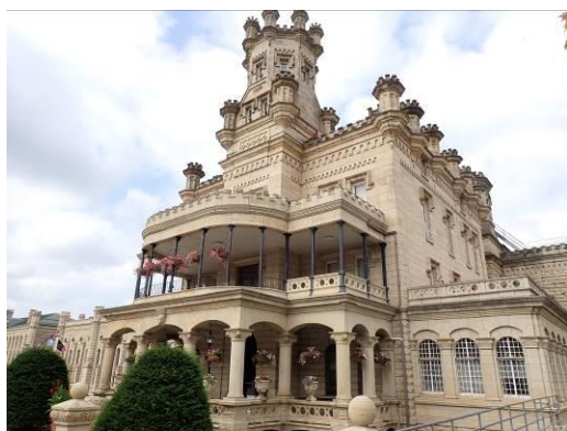
1. View from the northeast