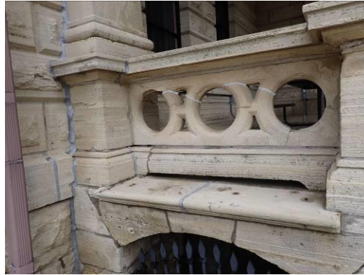
15, 16. Stone rail