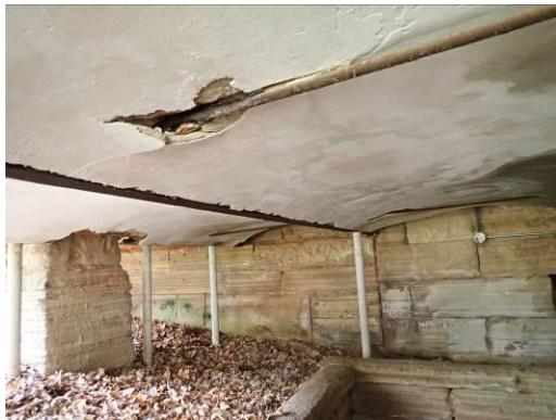
25, 26. Views of the soffit