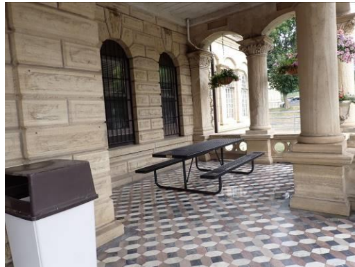
5, 6. Views of the elevated front entry area