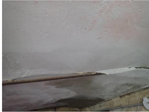
27, 28. Views of the soffit