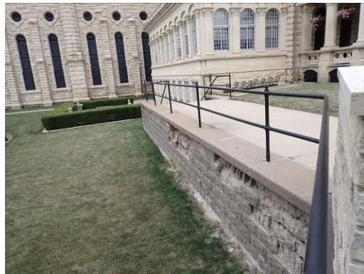
37, 38. Retaining walls to the west of the front entry