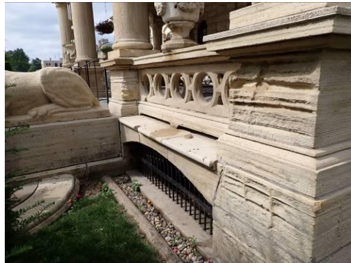
17, 18. Span of arch