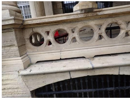
13, 14. Stone arch and stone rail