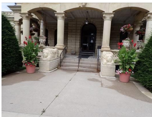
2. View of the east entry