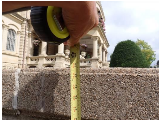
41, 42. Close up of wall failure