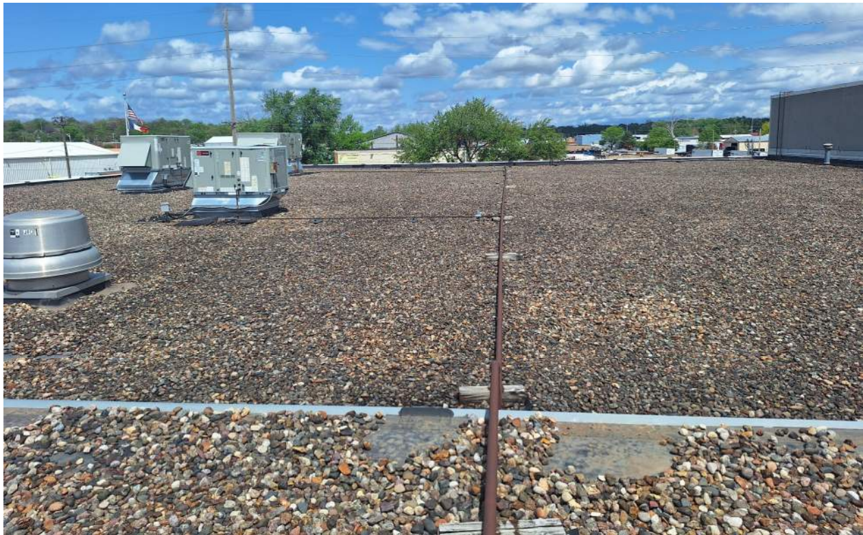
BUILDING EXTERIOR - NORTH HALF LOWER ROOF