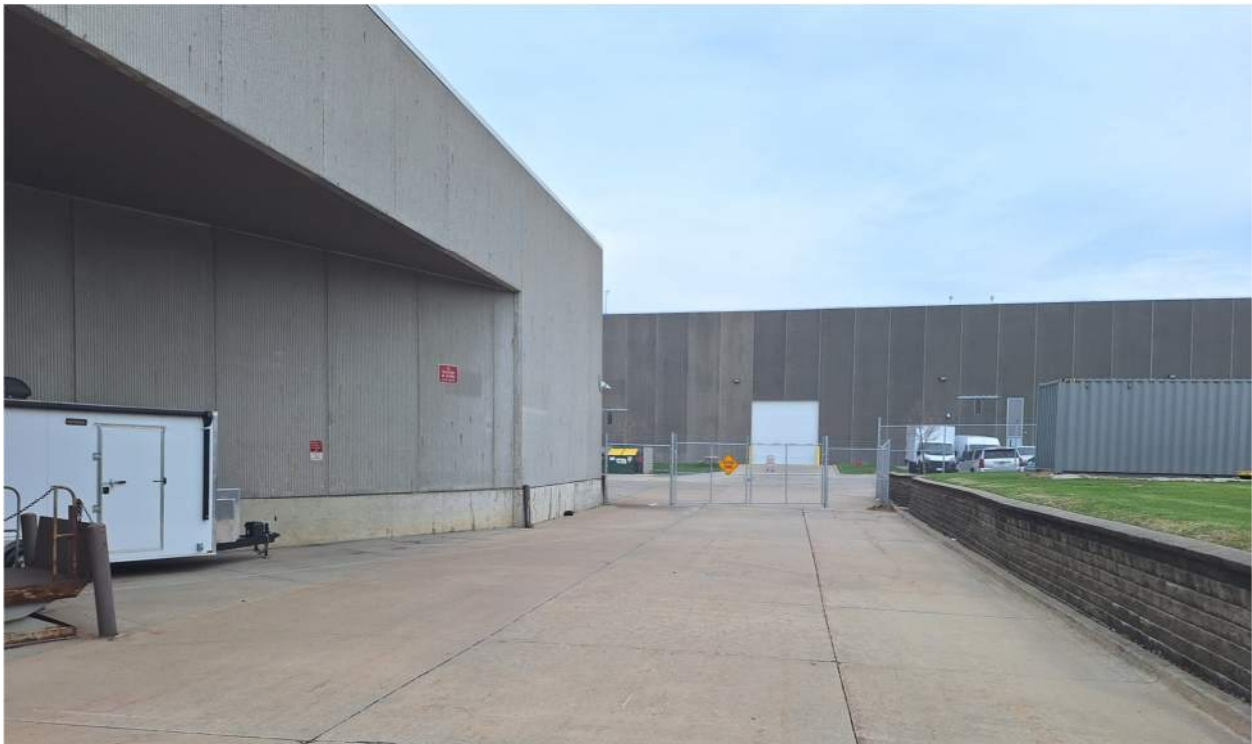
BUILDING EXTERIOR - SOUTHEAST LOADING DOCK & GATE