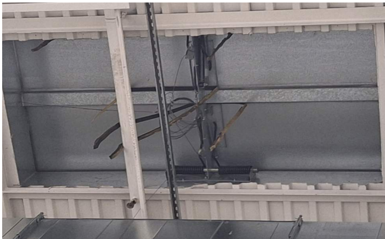
BUILDING INTERIOR - SMOKE VENT INSIDE