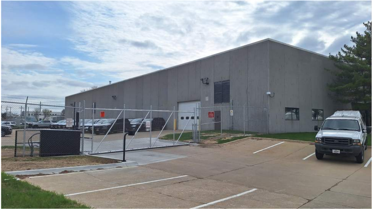
BUILDING EXTERIOR - WEST SIDE AND NORTHWEST GATE