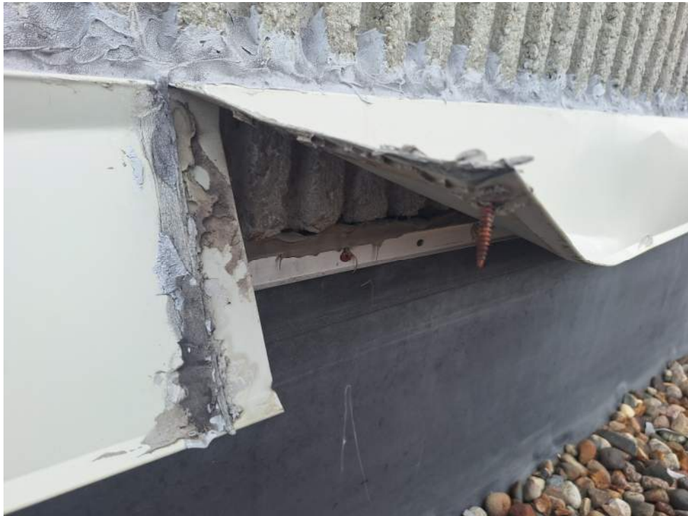
BUILDING EXTERIOR - COUNTERFLASHING ON SOUTH LOWER ROOF