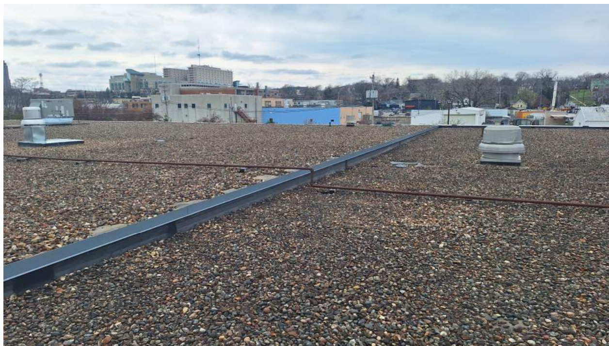
BUILDING EXTERIOR - STEP DOWN BETWEEN LOWER ROOF SECTIONS