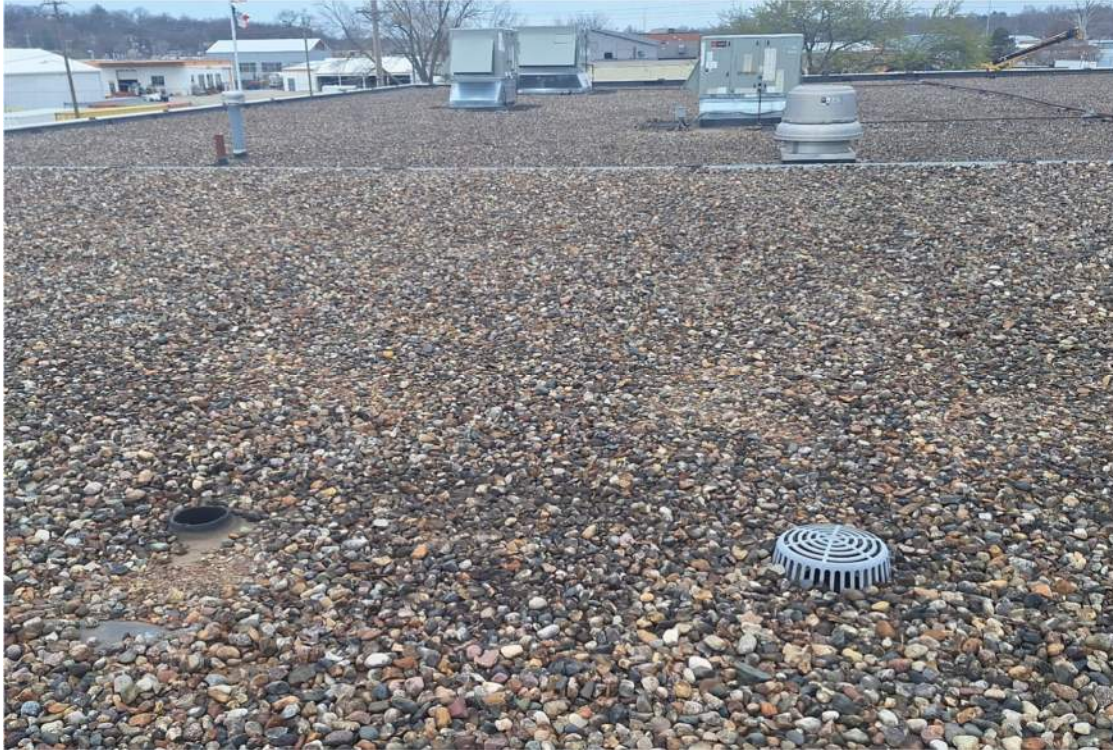
BUILDING EXTERIOR - EXISTING ROOF DRAIN AND OVERFLOW PIPE