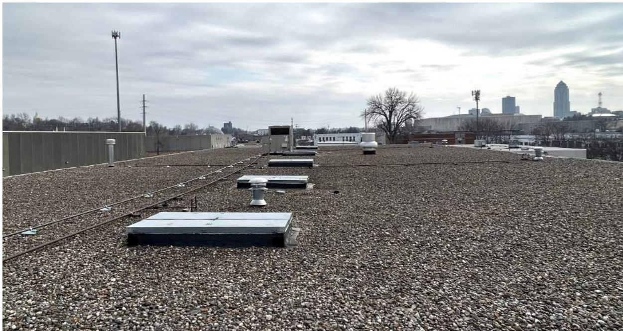
BUILDING EXTERIOR - SOUTH HALF UPPER ROOF