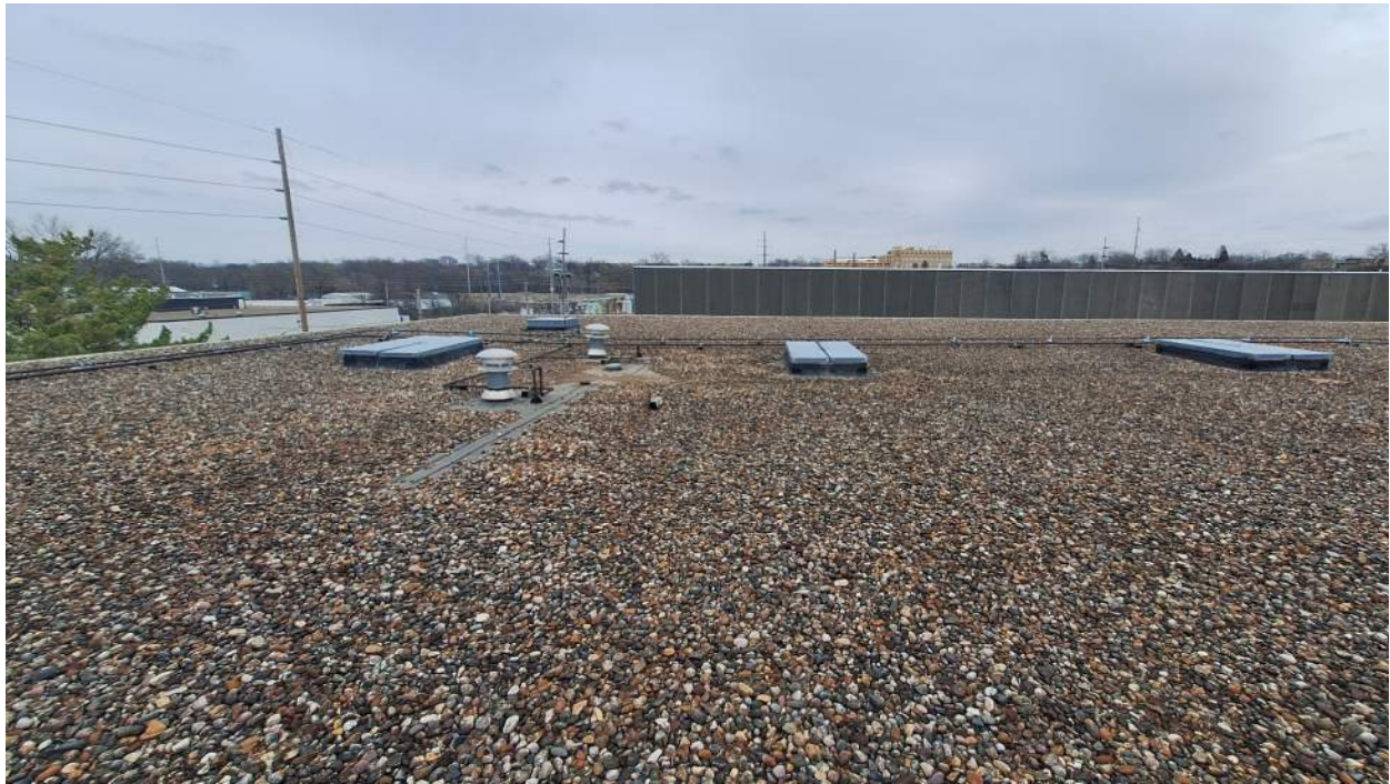
BUILDING EXTERIOR - NORTHEAST CORNER UPPER ROOF