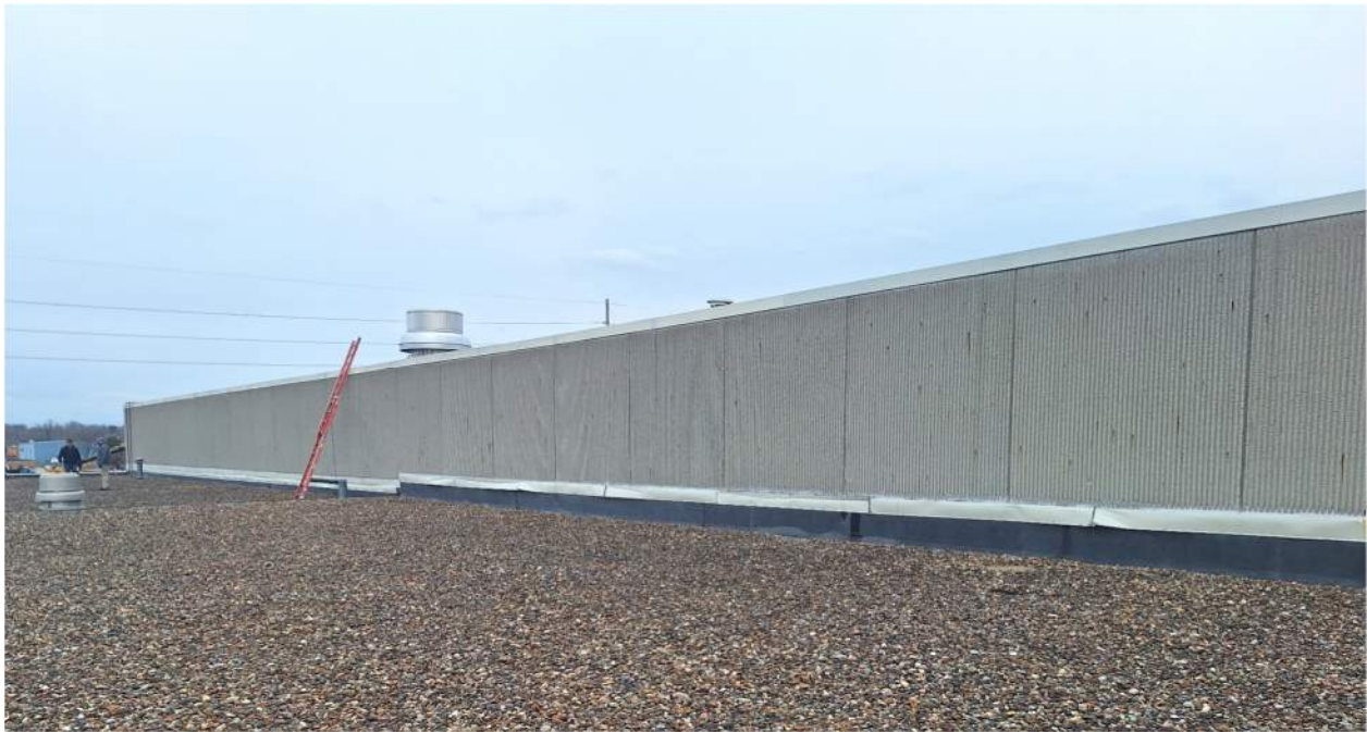
BUILDING EXTERIOR - FLASHINGS ALONG LOWER ROOF