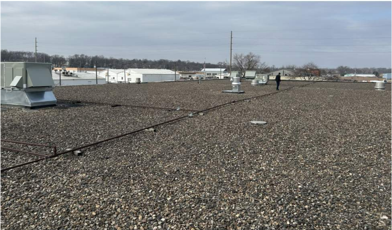
BUILDING EXTERIOR - LOWER ROOF LOOKING NORTH