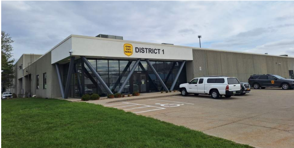
BUILDING EXTERIOR - NORTHWEST MAIN ENTRANCE