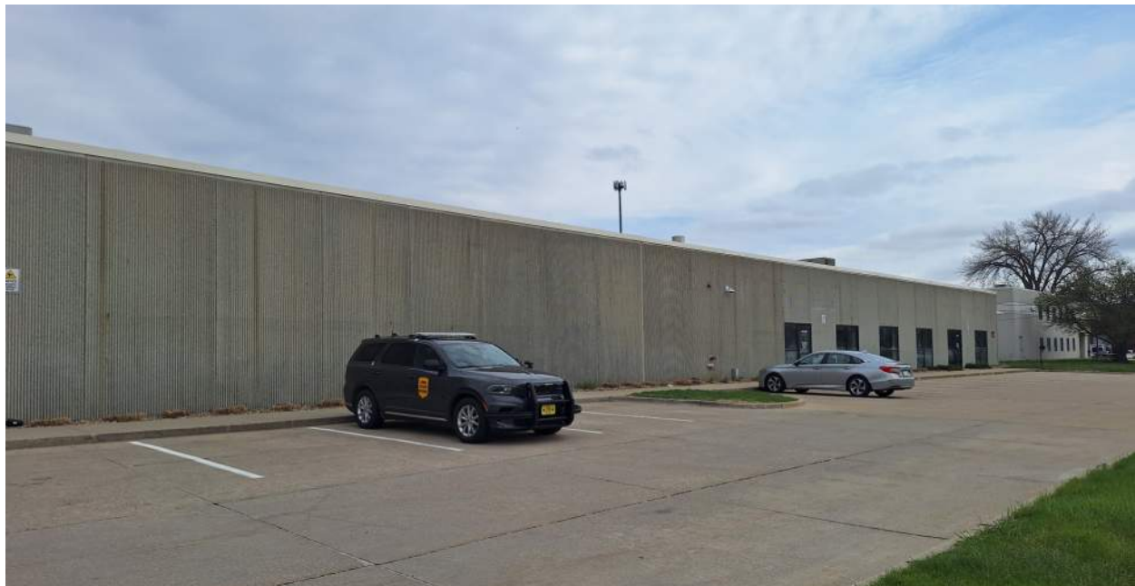
BUILDING EXTERIOR - WEST PARKING LOT