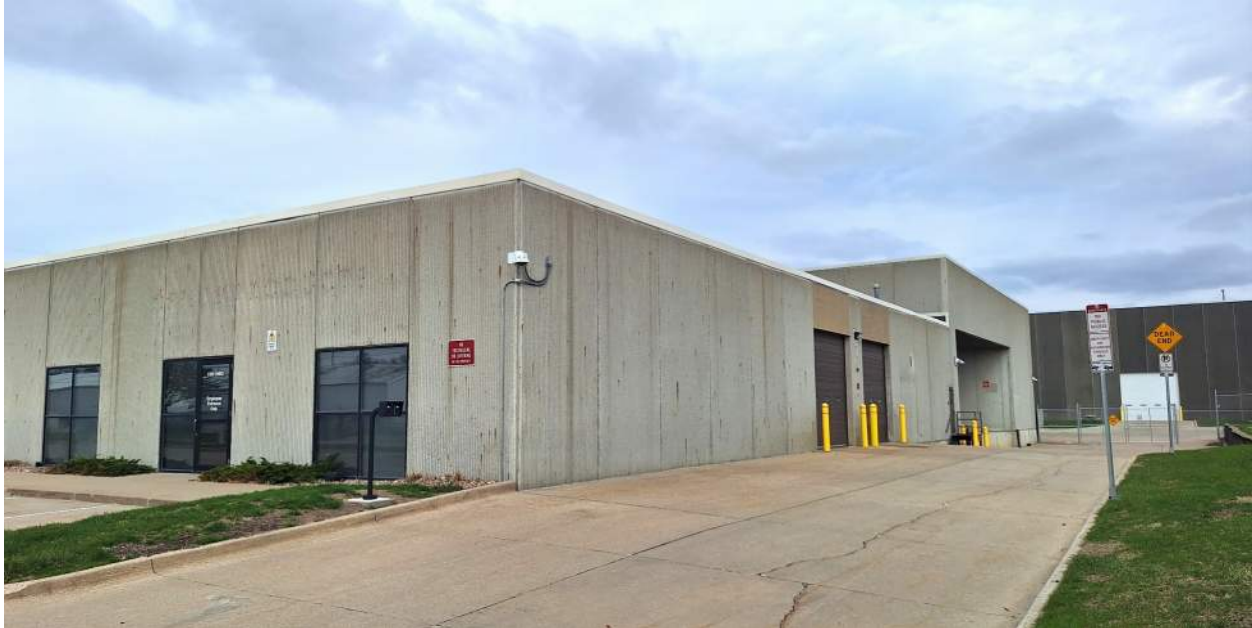
BUILDING EXTERIOR - SOUTH DRIVEWAY