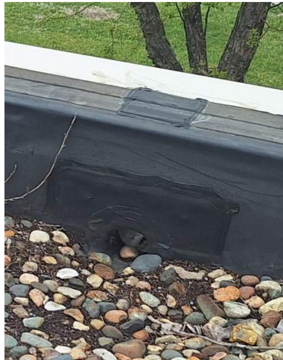
BUILDING EXTERIOR - OVERFLOW PIPE SCUPPER