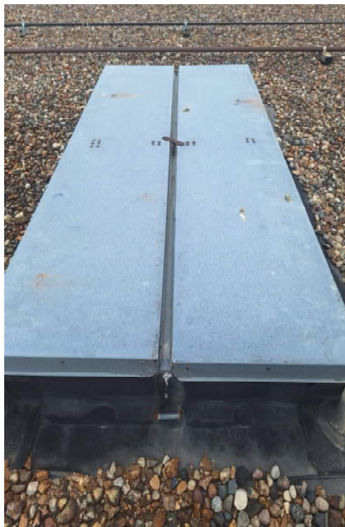
BUILDING EXTERIOR - SMOKE VENT UPPER ROOF