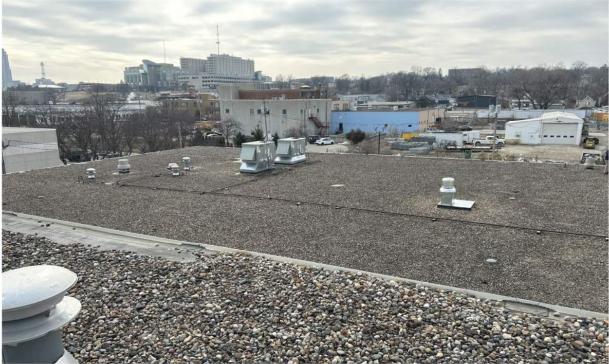
BUILDING EXTERIOR - SOUTH HALF LOWER ROOF