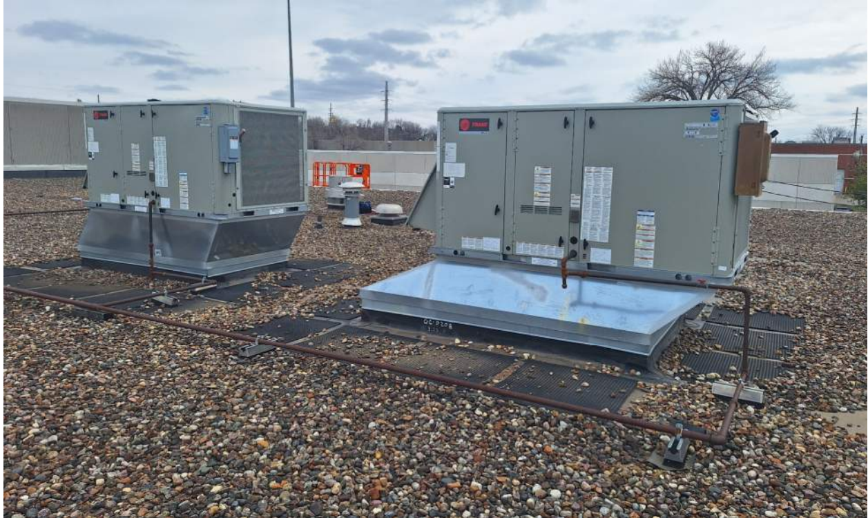
BUILDING EXTERIOR - ROOFTOP UNITS SOUTH SIDE LOWER ROOF