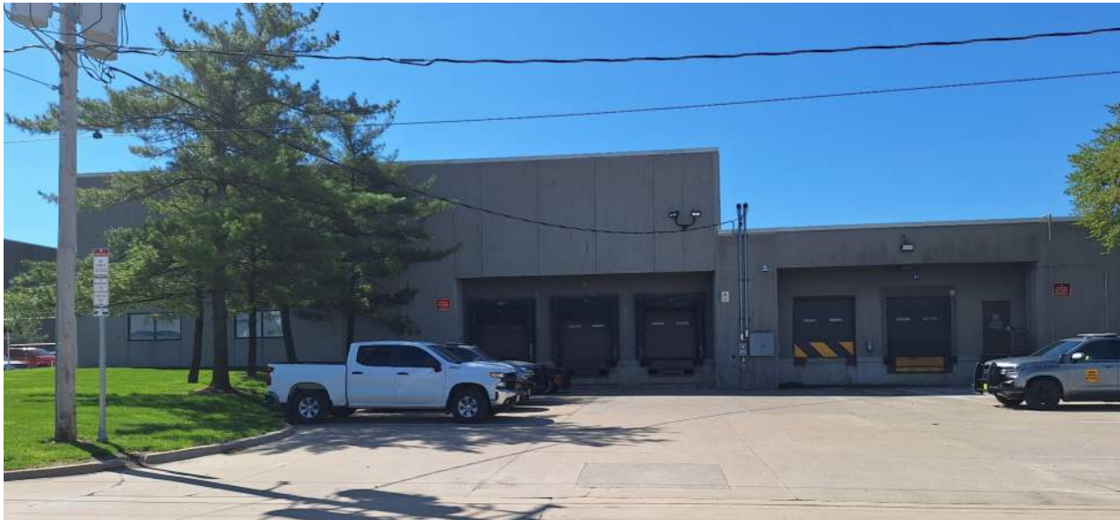
BUILDING EXTERIOR - NORTH SIDE STAGING AREA & ROOF ACCESS