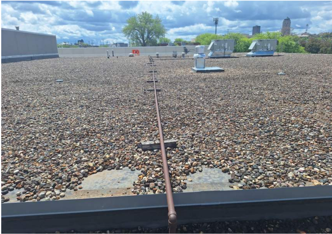
BUILDING EXTERIOR - SOUTH HALF LOWER ROOF