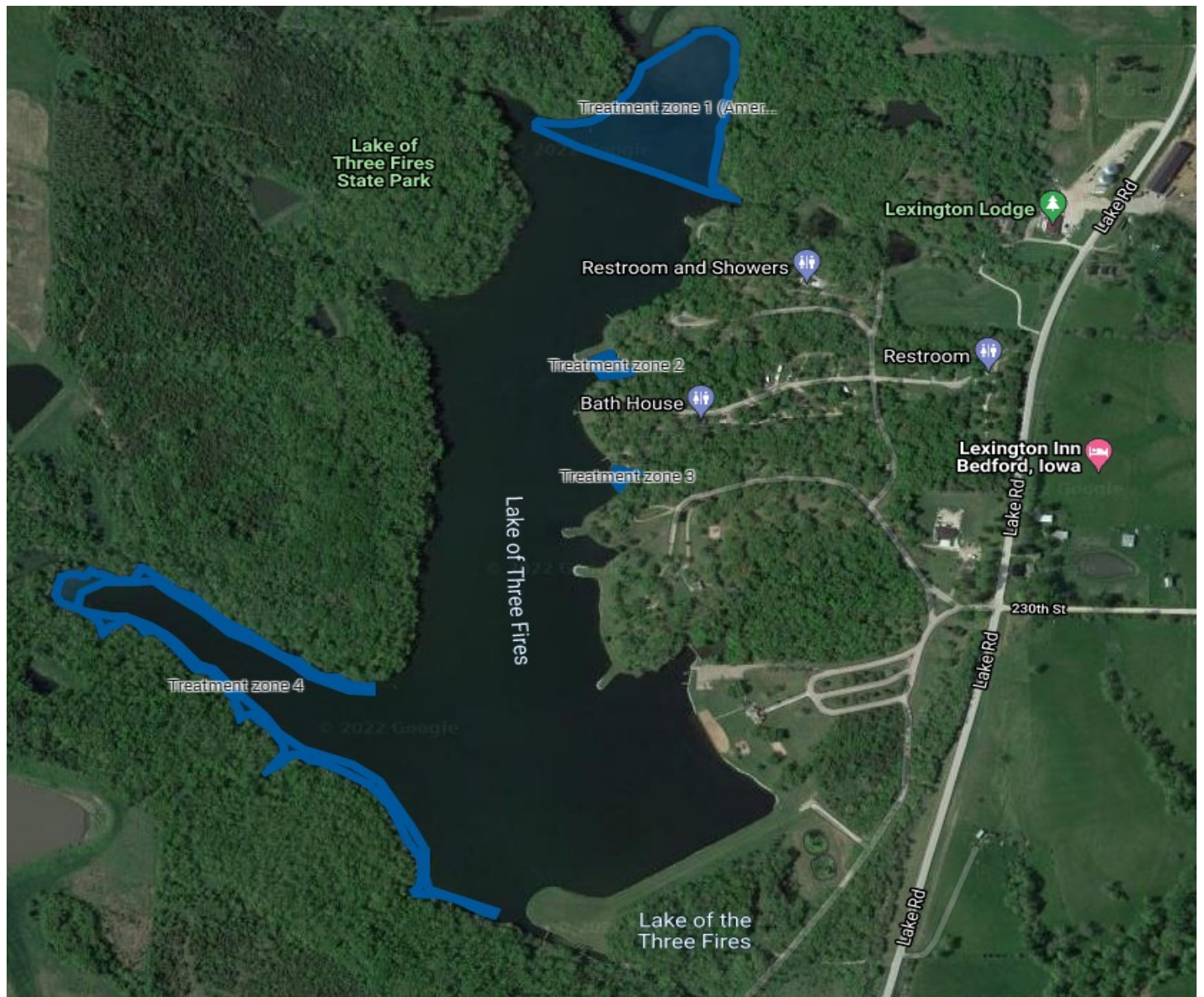
Lake of Three Fires Treatment Zones highlighted in blue