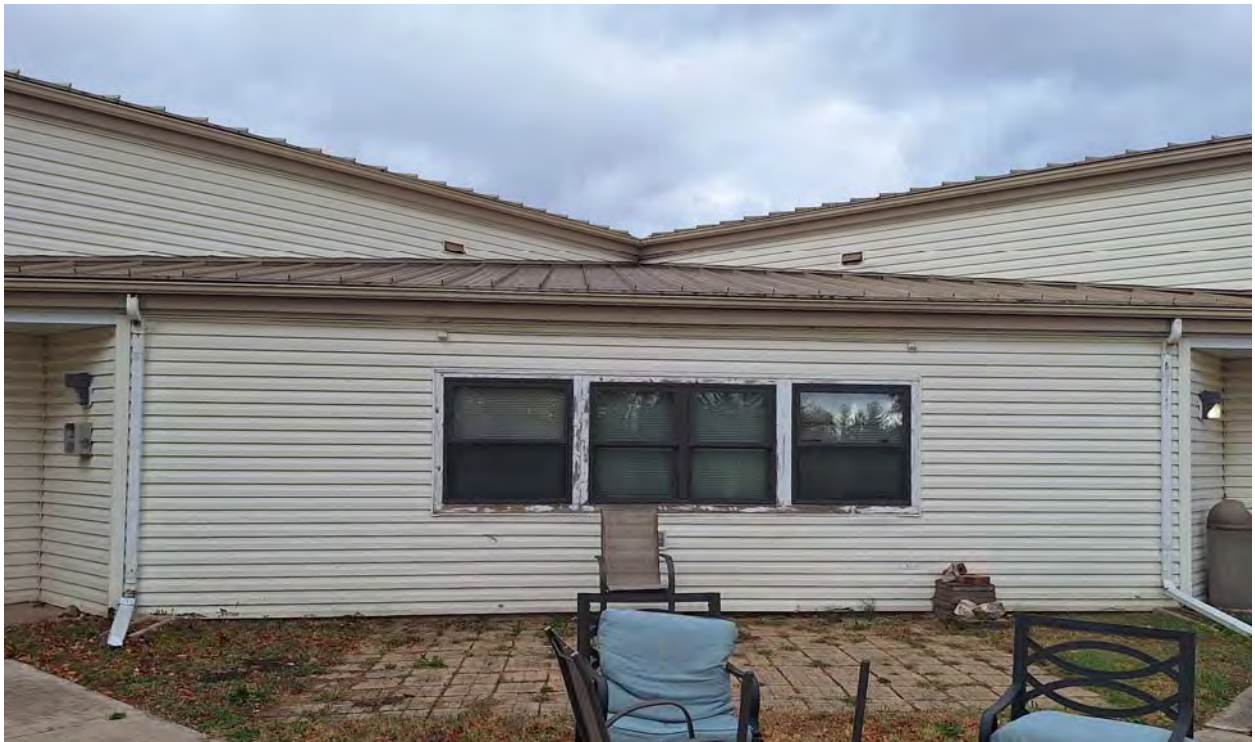
101 FRANKLIN - PATIO WINDOWS