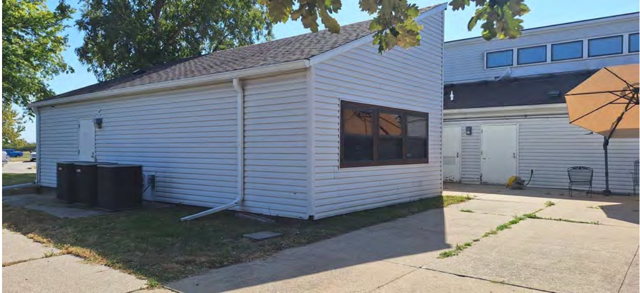
200 FRANKLIN - EAST PATIO