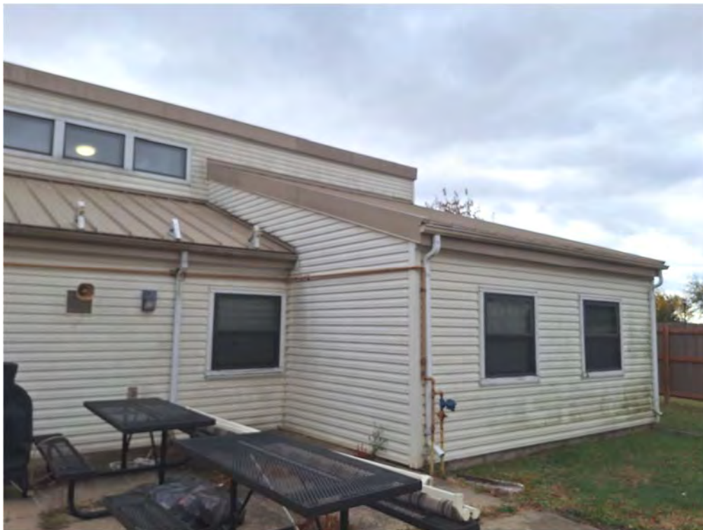
101 FRANKLIN - BACK PATIO