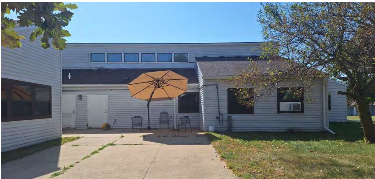
200 FRANKLIN - SOUTHEAST SIDE