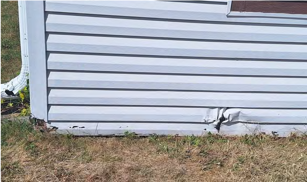
200 FRANKLIN - EXISTING DAMAGED SIDING