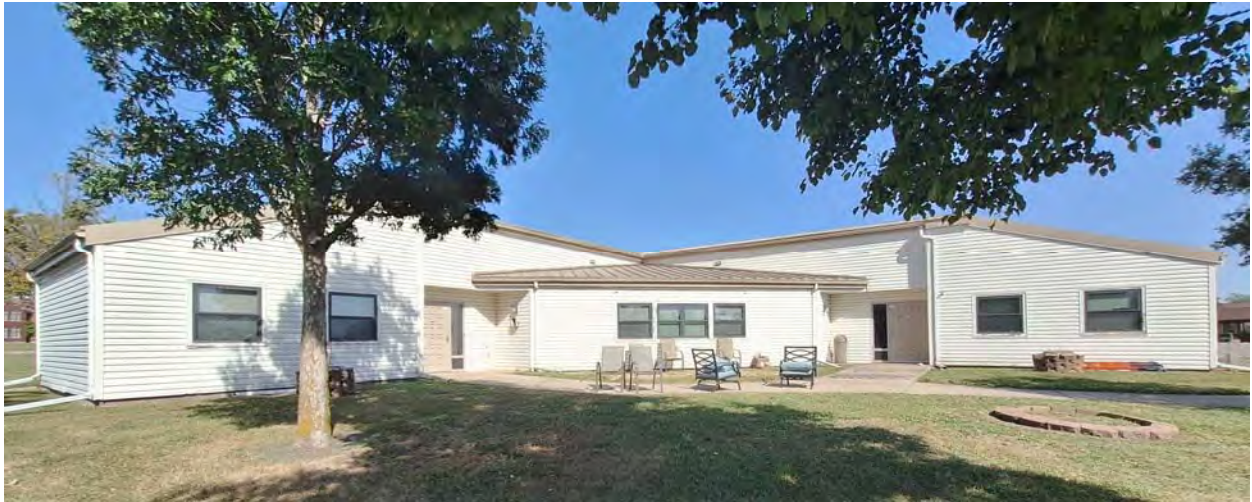
101 FRANKLIN - SOUTHWEST VIEW