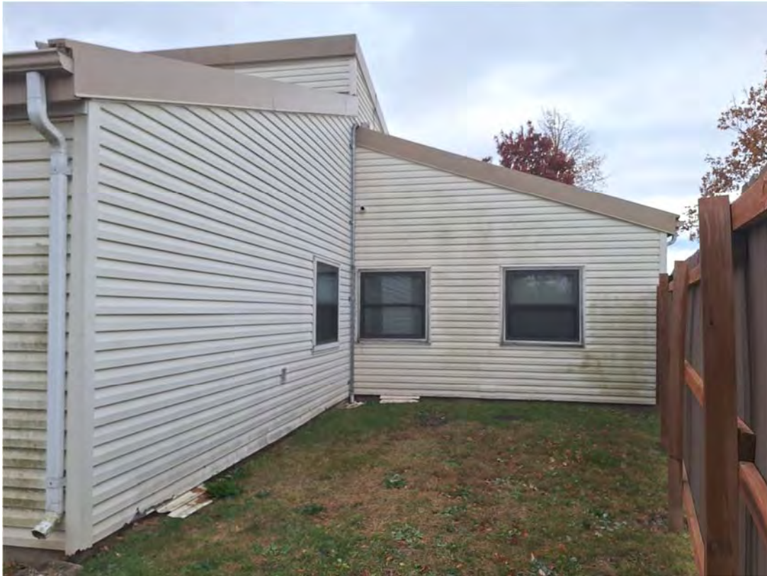
101 FRANKLIN - WEST CORNER