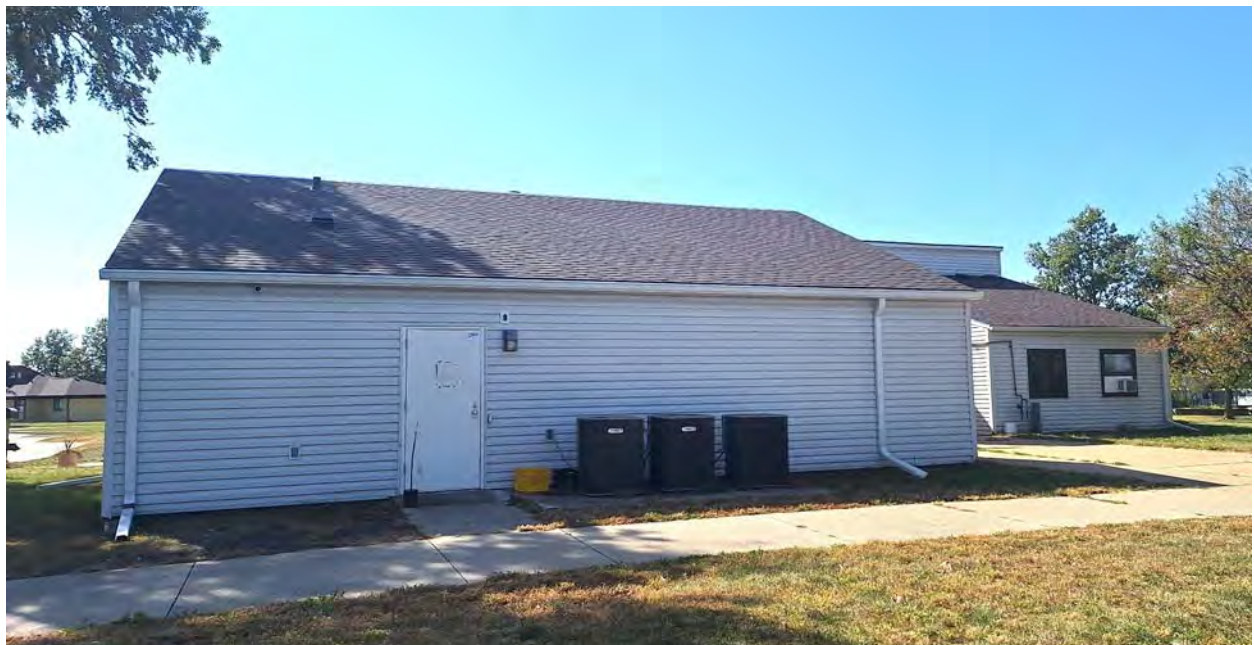
200 FRANKLIN - SOUTHEAST SIDE