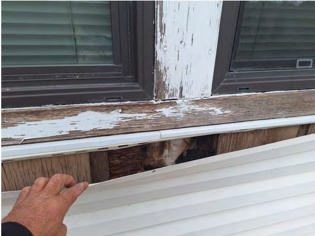
101 FRANKLIN - ROTTED SHEATHING UNDER WINDOWS