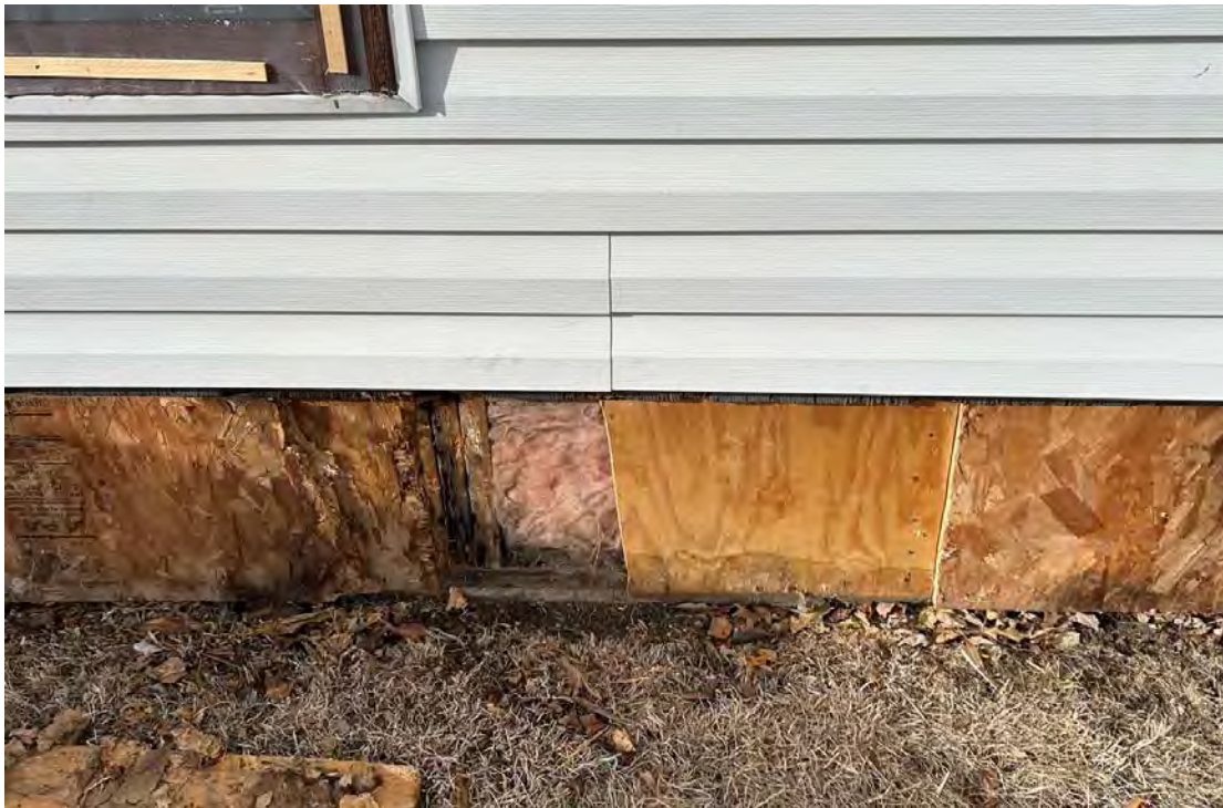
101 FRANKLIN - EXPLORATORY DEMO AT SIDING BASE