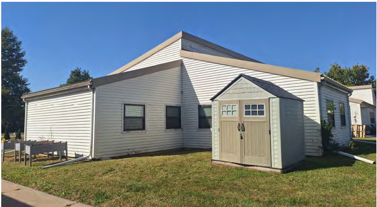
101 FRANKLIN - SOUTH CORNER