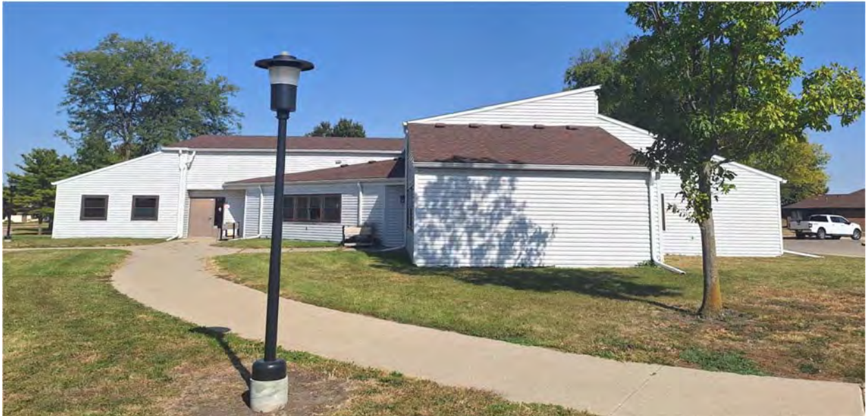
200 FRANKLIN - WEST SIDE