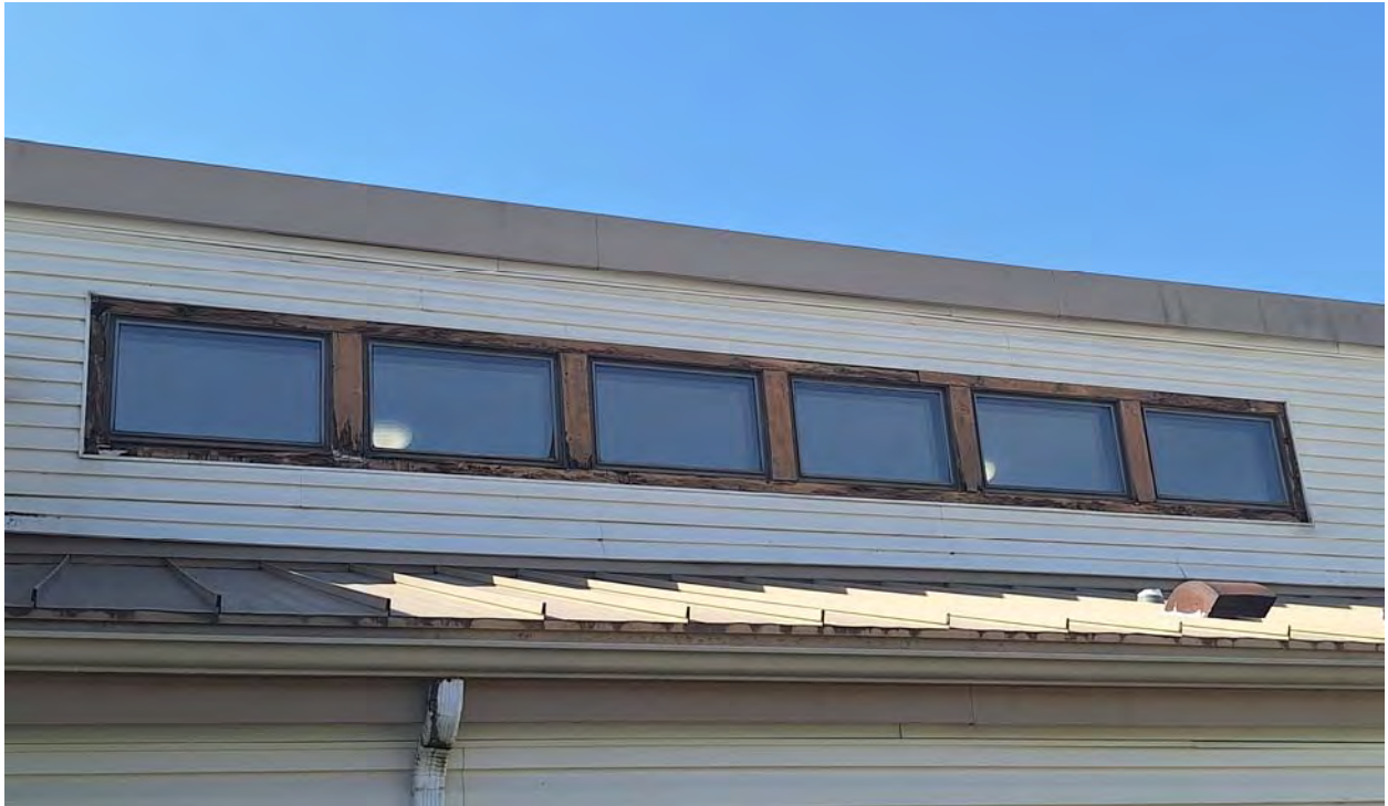
101 FRANKLIN - CLERESTORY WINDOWS