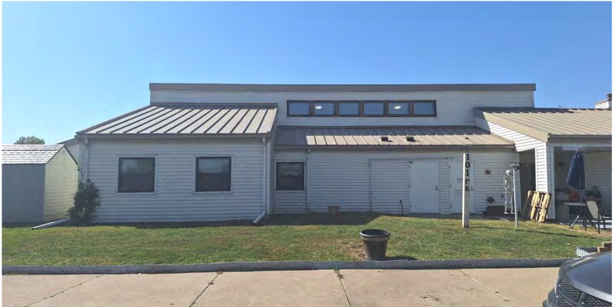
101 FRANKLIN - LEFT OF FRONT ENTRANCE