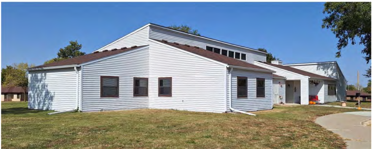
200 FRANKLIN - WEST SIDE