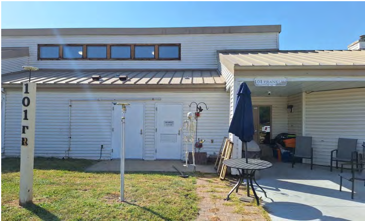
101 FRANKLIN COTTAGE FRONT ENTRANCE