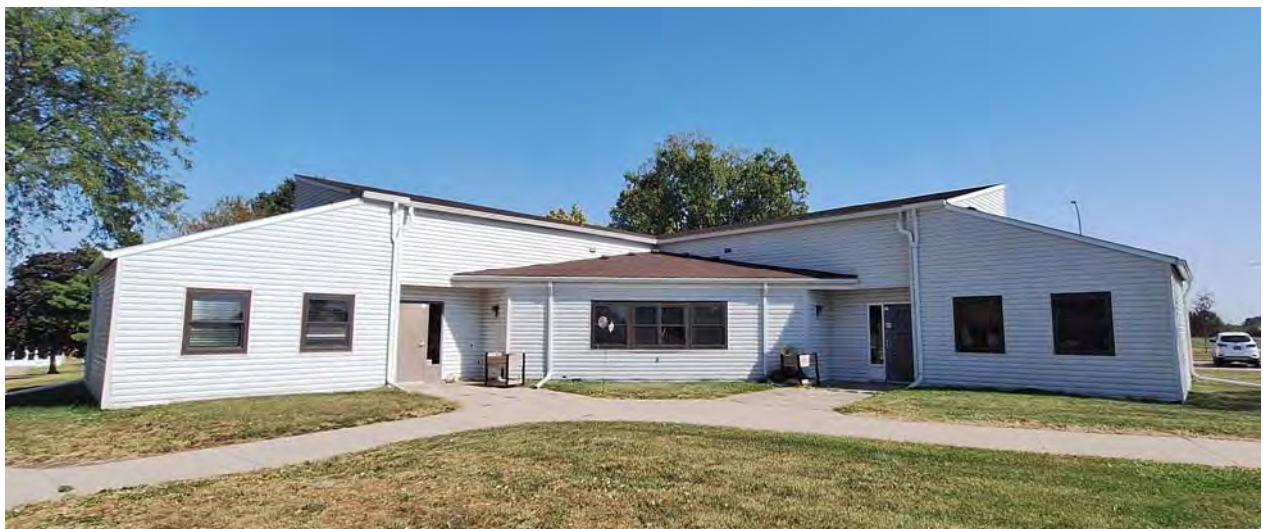
200 FRANKLIN - NORTHWEST SIDE