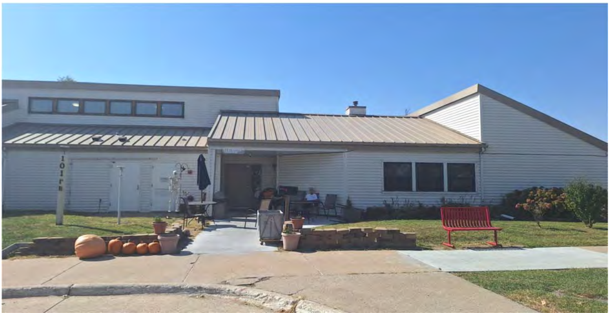
101 FRANKLIN - RIGHT OF FRONT ENTRANCE