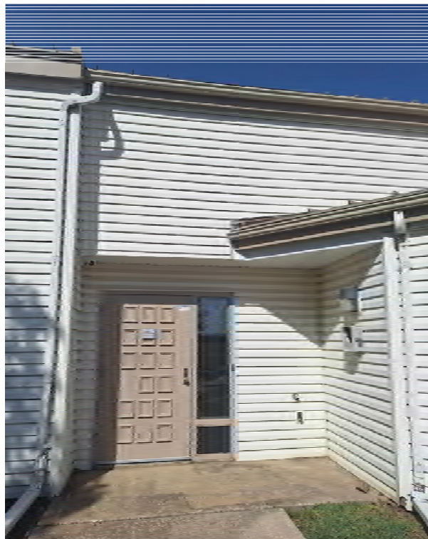
101 FRANKLIN - RECESSED DOORWAY AT PATIO