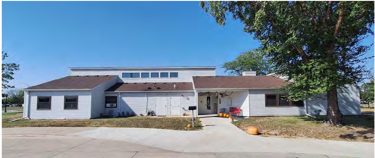
200 FRANKLIN - FRONT