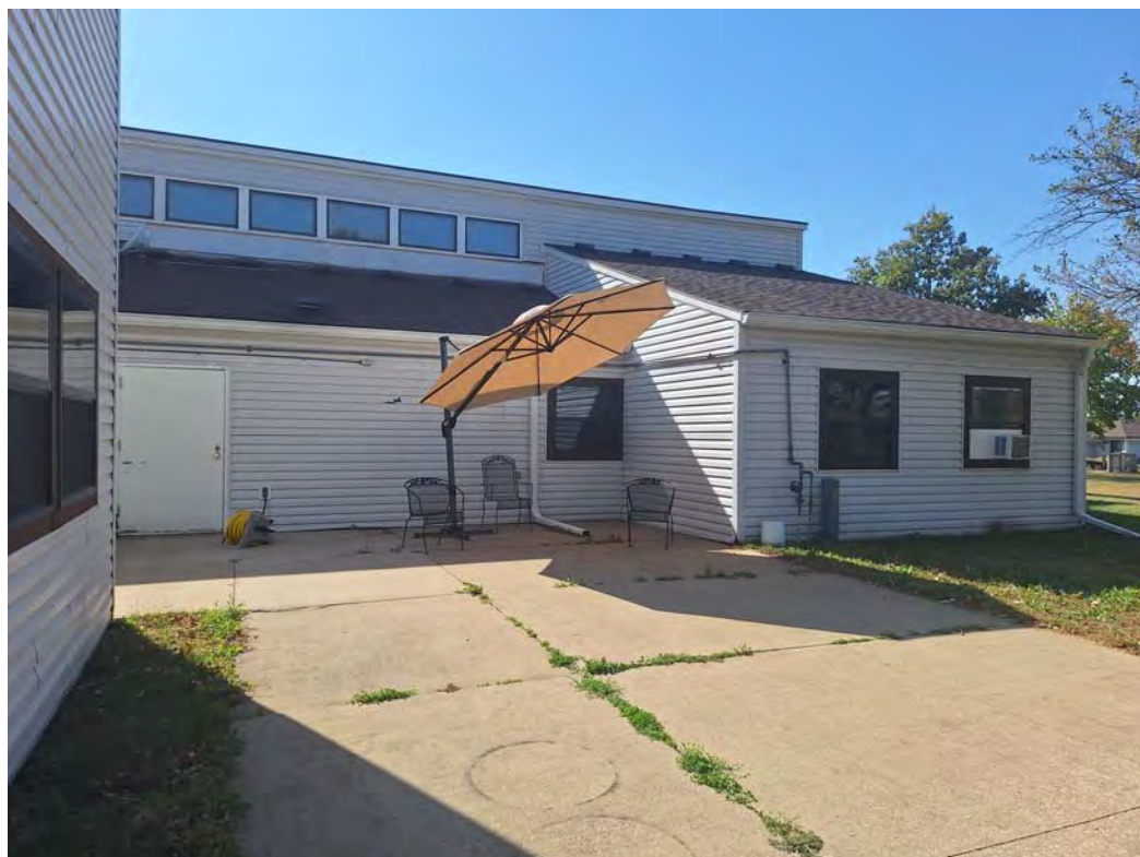
200 FRANKLIN - SOUTHEAST SIDE