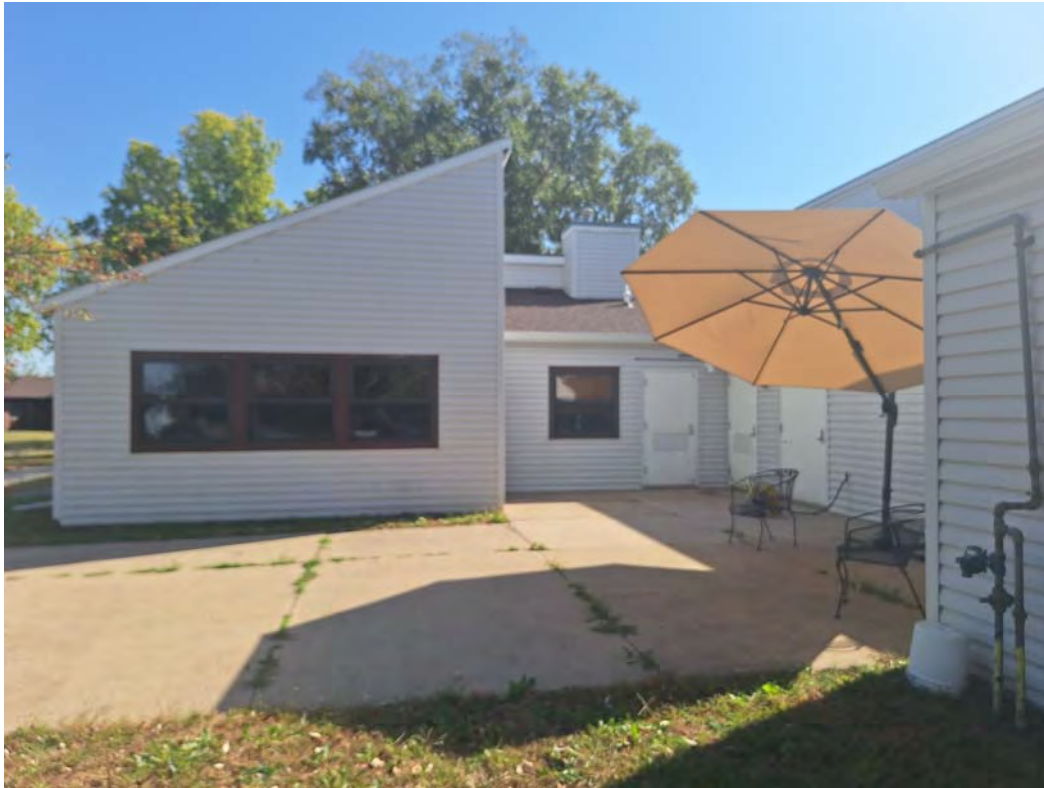
200 FRANKLIN - EAST PATIO