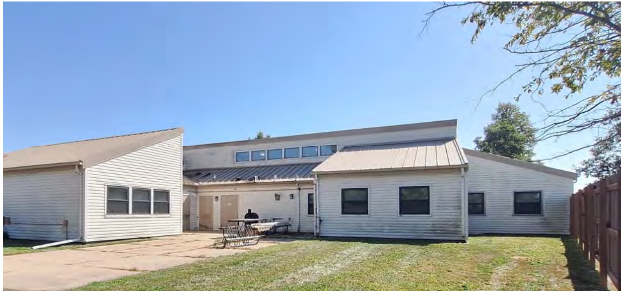
101 FRANKLIN - EAST SIDE