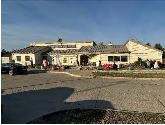
Photo #1 Looking at Cottage located at 101 Franklin Street, Woodward, Iowa.

Date Taken: October 21, 2024 ■ Atlas Project No. 204BS07878