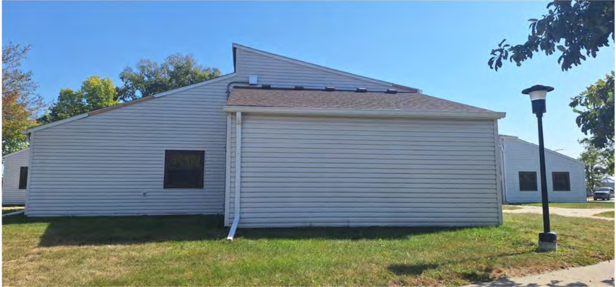
200 FRANKLIN - NORTH SIDE