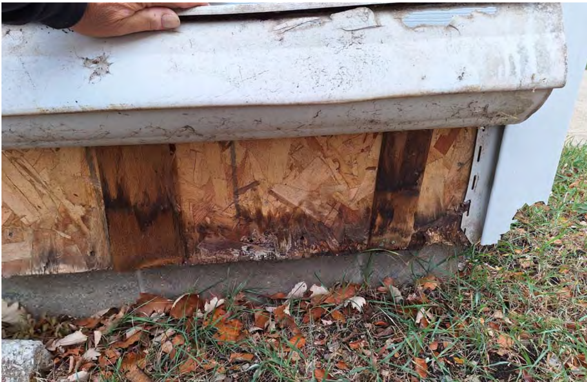
200 FRANKLIN - EXISTING DAMAGED SHEATHING