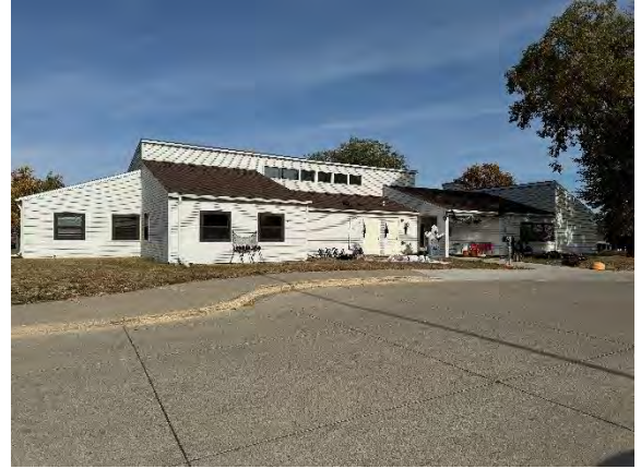
Photo #2 Looking at Cottage located at 200 Franklin Street, Woodward, Iowa.