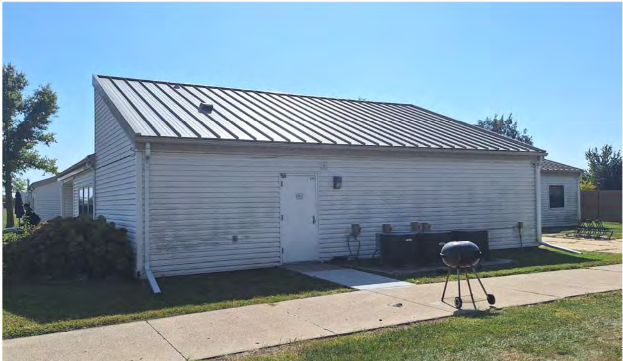
101 FRANKLIN - EAST SIDE