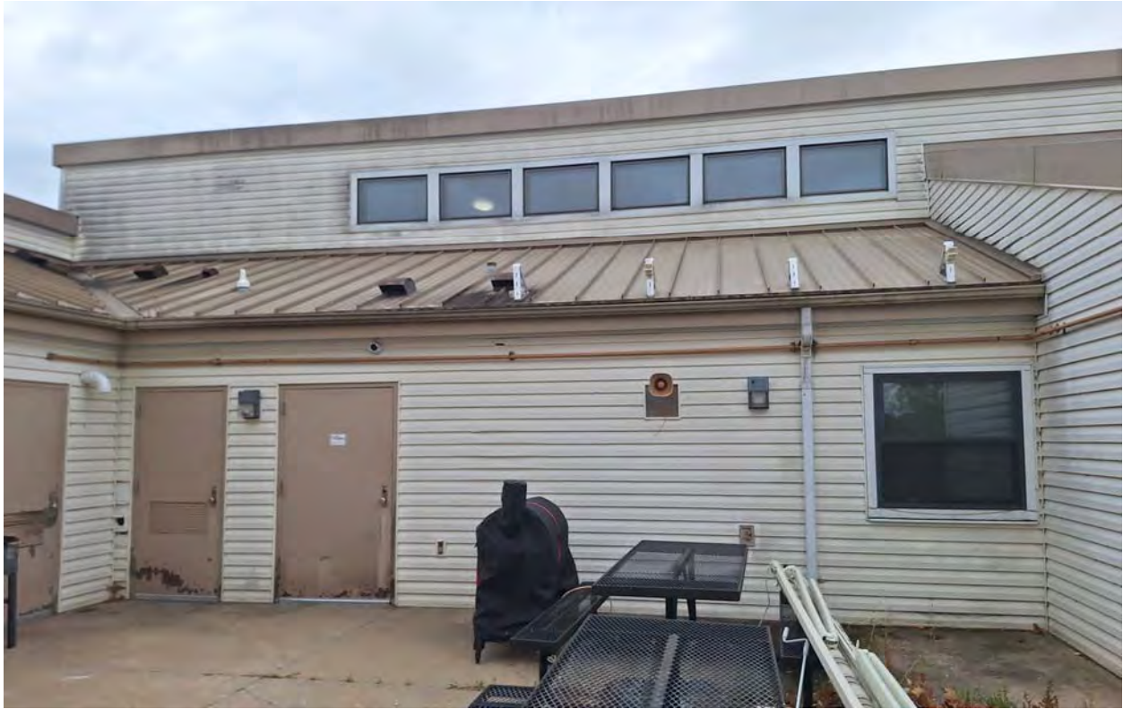
101 FRANKLIN - BACK PATIO