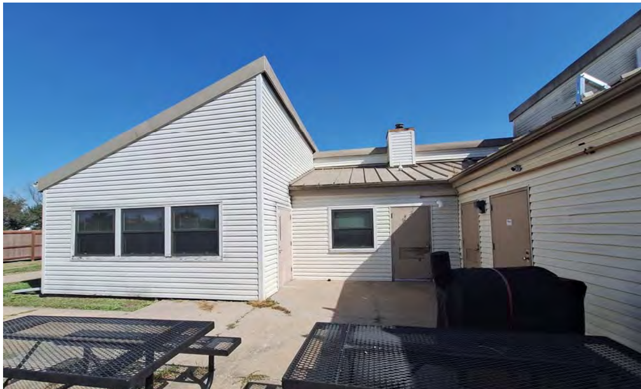
101 FRANKLIN - BACK PATIO