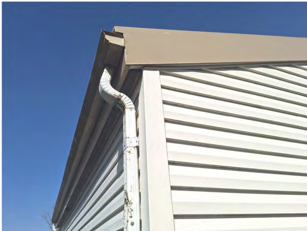
101 FRANKLIN - VENTED EAVES AT GUTTER