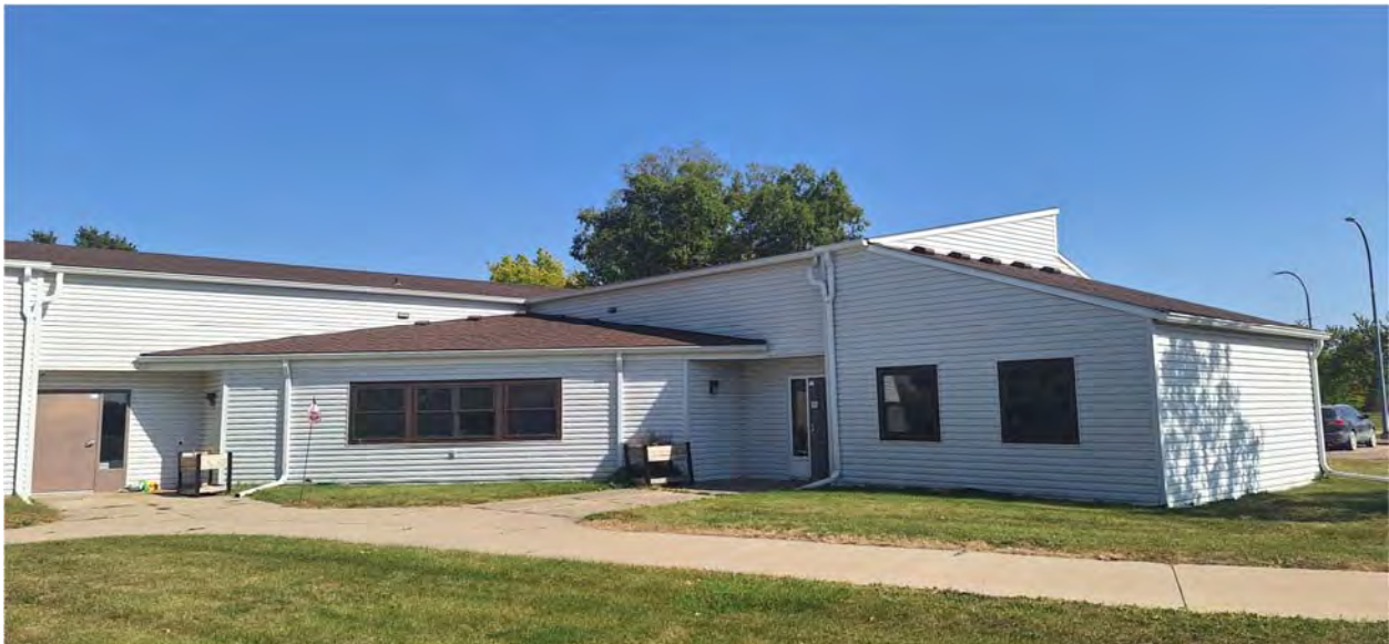
200 FRANKLIN - NORTHWEST SIDE