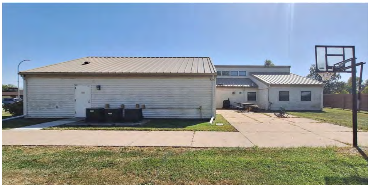
101 FRANKLIN - EAST SIDE