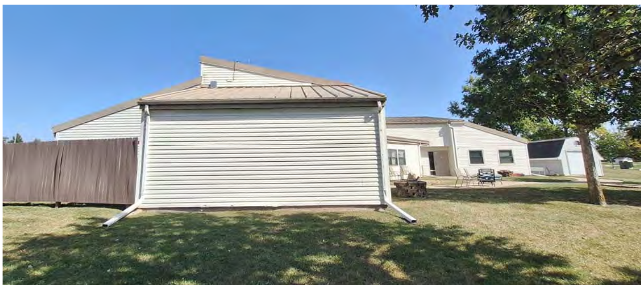
101 FRANKLIN - WEST SIDE