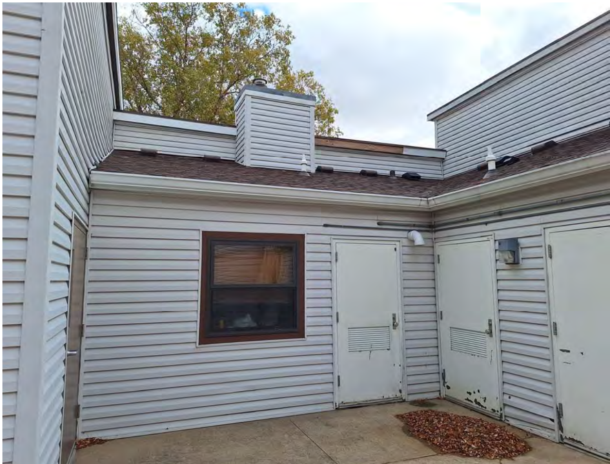
200 FRANKLIN - MECHANICAL ROOM DOORS AND CHIMNEY