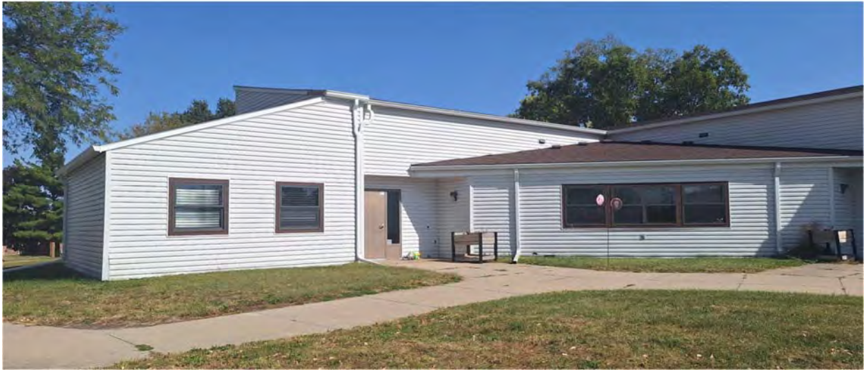
200 FRANKLIN - NORTHWEST SIDE