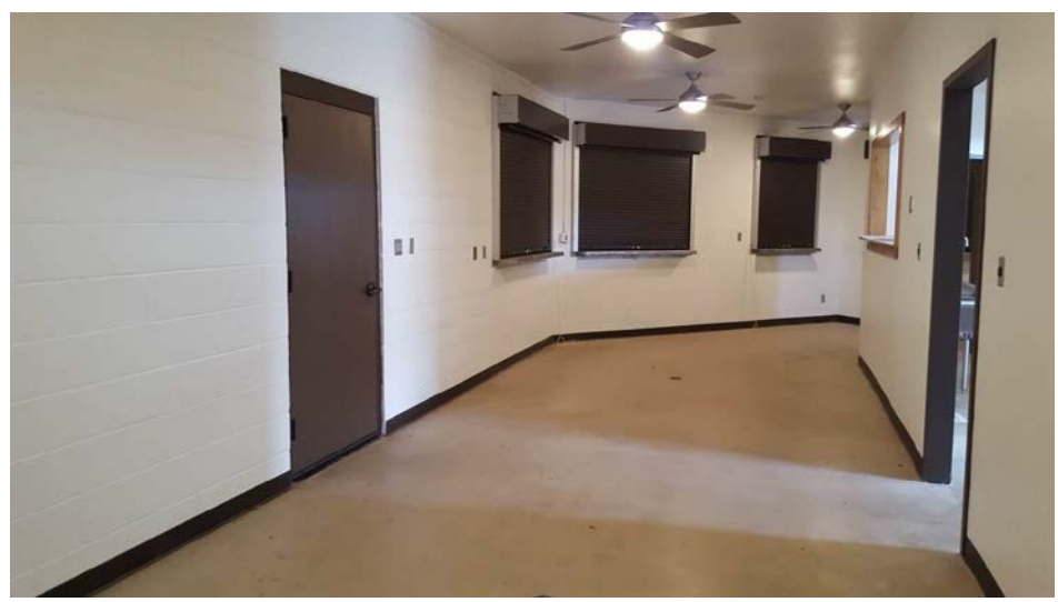
Figure 2. Concession Area (looking east)