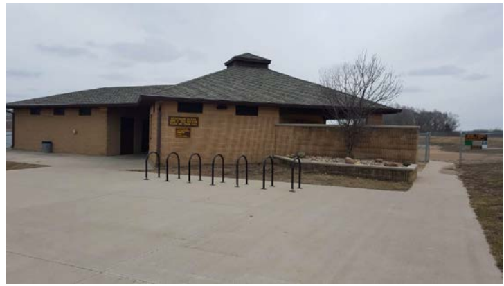
Figure 2 – Exterior – parking side