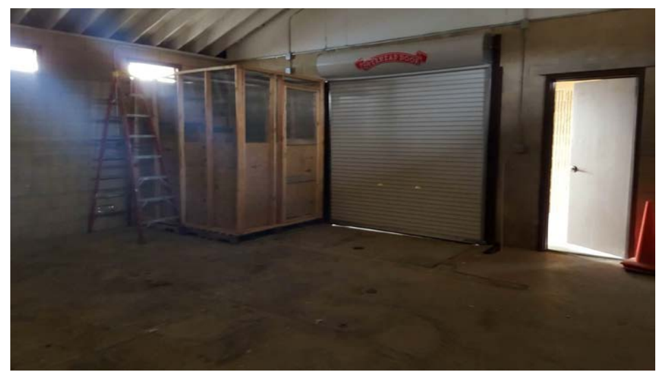
Figure 6. Interior of Storage Area – different view