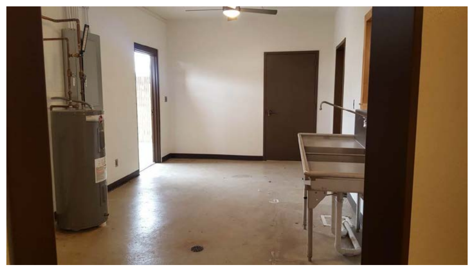
Figure 3. Kitchen Prep Area