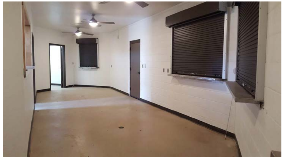
Figure 1. Concession Area (looking west to storage area)