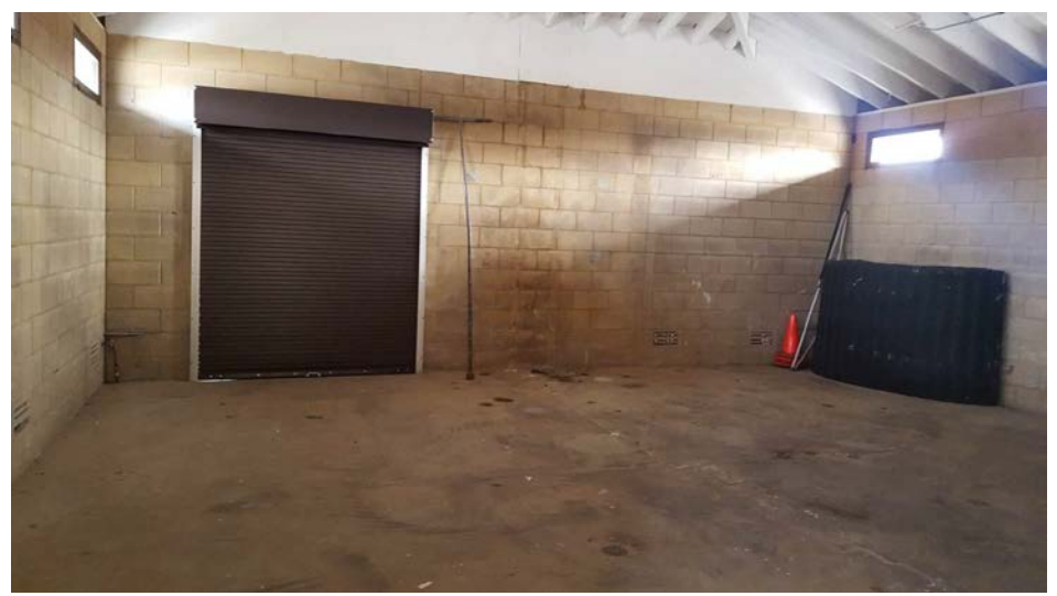
Figure 5. Interior of Storage Area