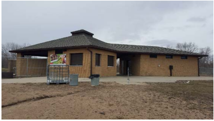
Figure 1 – Exterior – beach side (right section is storage area)

1.4.4 Concession Location. A map of George Wyth is attached (Attachment #6). A map highlighting the concession premises is attached (Attachment #7). A layout of the concession building (including interior photos) is attached (Attachment #8).