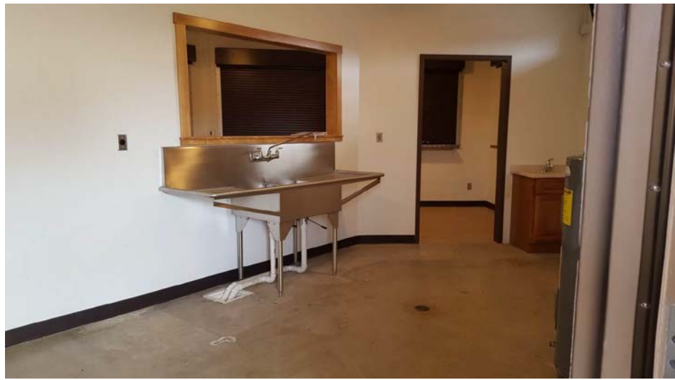
Figure 4. Kitchen Prep Area – different view (note: the sink has been changed to a 3-compartment sink)