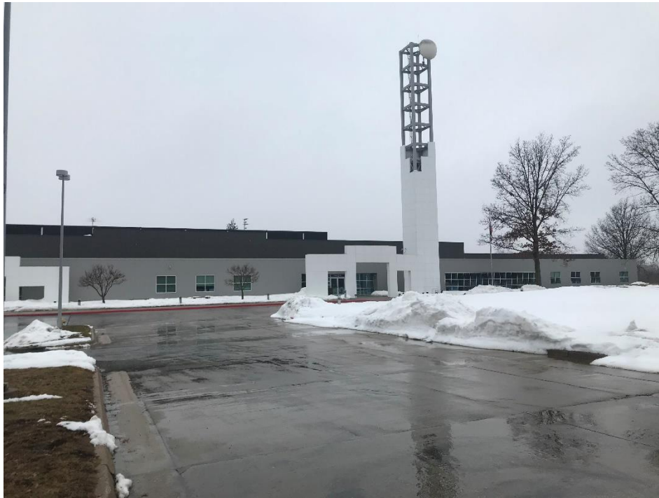
Exterior view of the site.