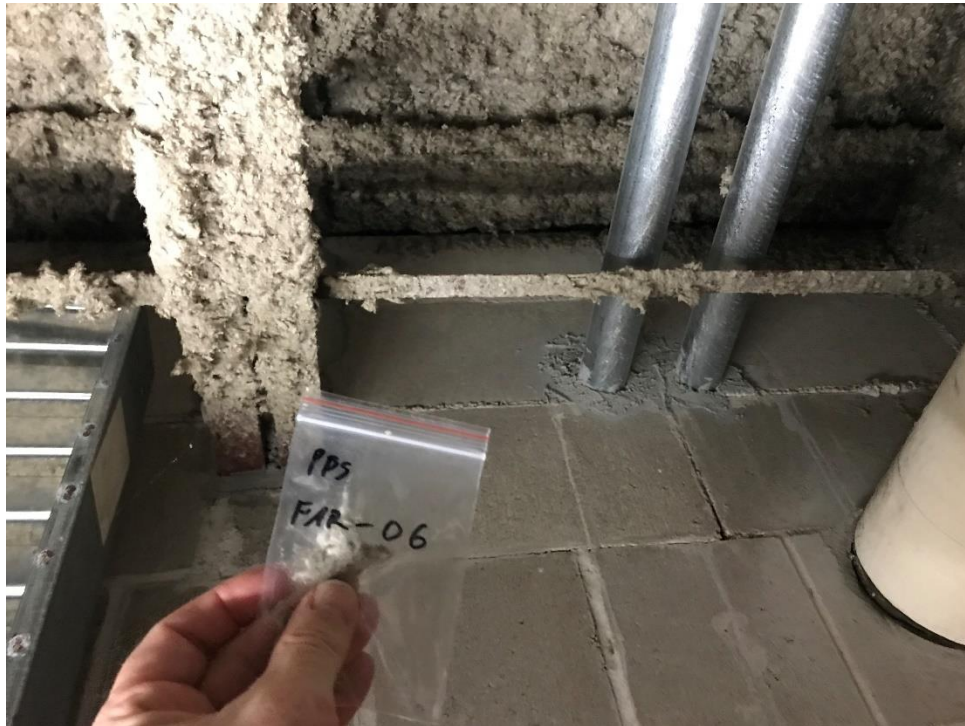
Suspect spray-on fireproofing sampled. Does not contain asbestos.