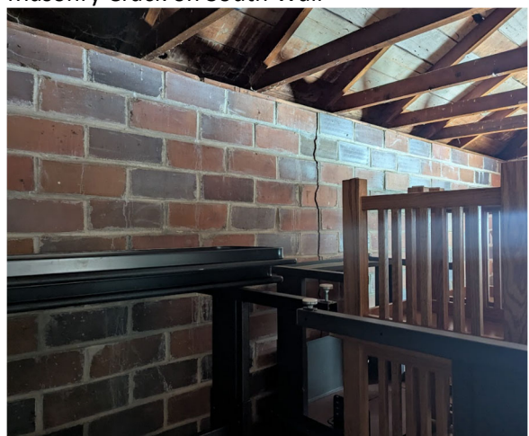
Masonry Crack at divider wall