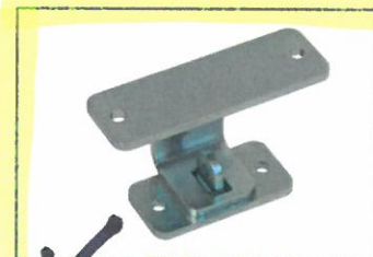
520-H-026860 Floor mounting hardware