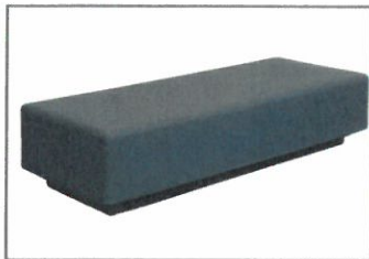
450-10 30"d x 80"w x 14"h

In circumstances where seclusion or restraint become necessary, Moduform's seclusion beds have been designed with consideration for both patient and staff safety. Beds were engineered to comply with Life Safety Codes, withstand constant heavy-use and severe handling, prevent serious injury and be easily cleaned and maintained to help in the fight of harmful bacteria and bloodborne pathogens. There are no frames, no springs, no seams, no puddling of material and no hard surfaces. The union of the one-piece, integral shaped high-density foam core fused to the 200 mil polyvinyl skin enables each piece to meet the needs of uncompromising environments. Impervious to fluids, the seamless, pick and puncture resistant polyvinyl skin is mechanically fastened and gasketed to a rotationally molded, high-impact polyethylene base. Anchoring kits can be ordered that allow for maintainers to quickly detach the unit for cleaning. Secure 450-11 beds feature 10 restraint rings per bed. Weighing more than 200 pounds, it's simple, durable, dependable and safe design make it the leader seclusion room solutions.