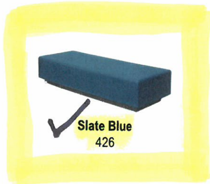
Slate Blue 426