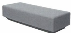
Flannel Grey 845