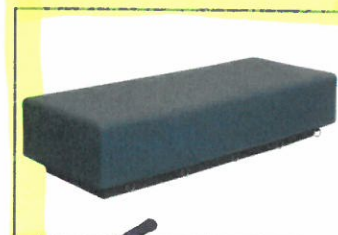
450-11 30"d x 80"w x 14"h