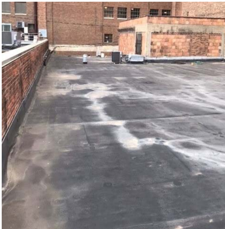
ROOF - WEST HALF LOOKING TOWARD REAR ALLEY