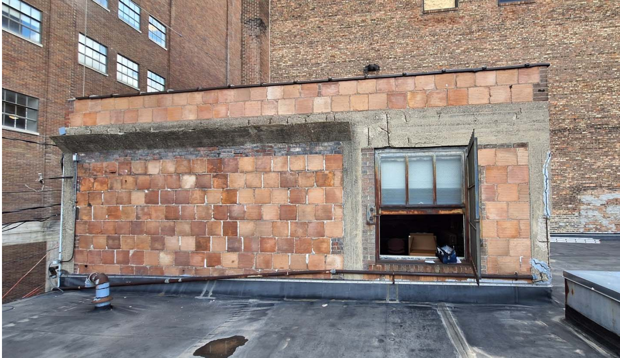
BUILDING EXTERIOR - UPPER SOUTH WALL