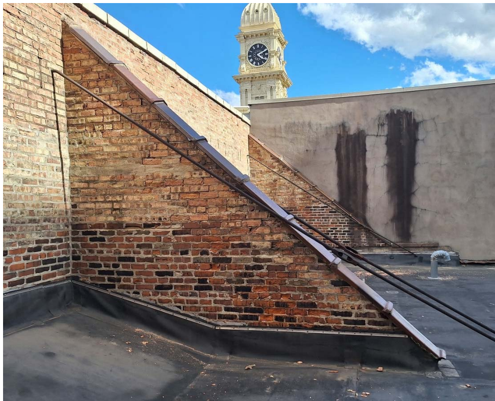
BUILDING EXTERIOR - NORTH SIDE CENTER BRACE WALL - SEE 3/A1.2