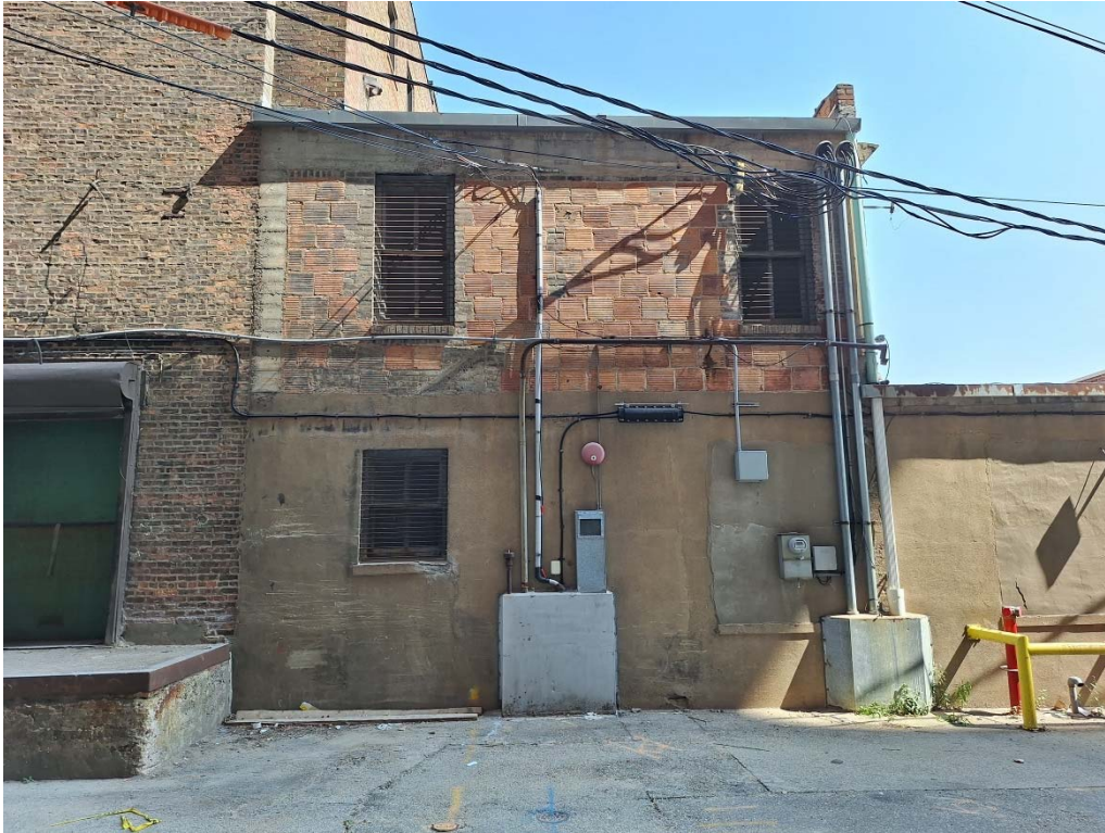
BUILDING EXTERIOR - NORTH HALF REAR WALL