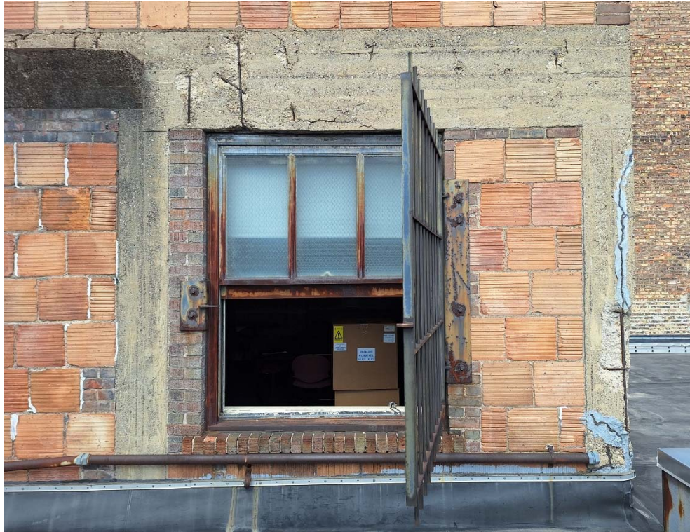
BUILDING EXTERIOR - ROOF ACCESS WINDOW & CONCRETE REPAIRS