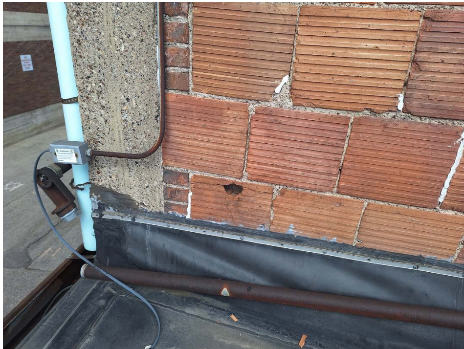
BUILDING EXTERIOR - UPPER STORY TYPICAL HOLE IN CLAY TILE