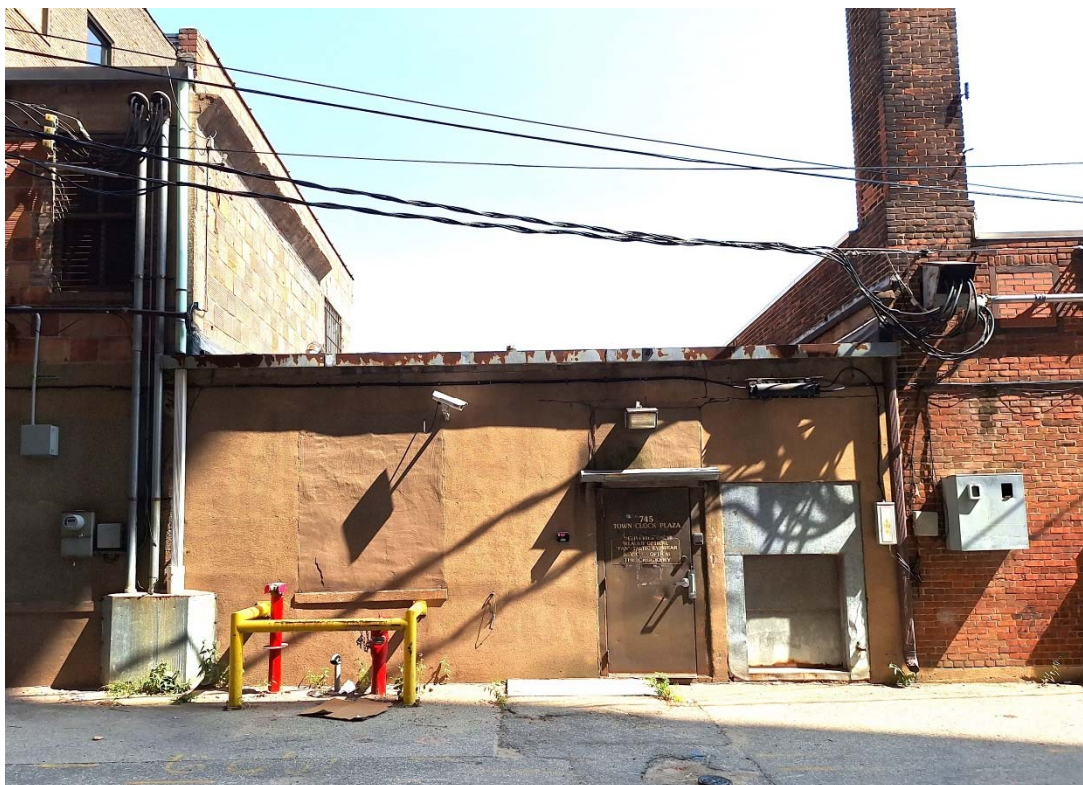
BUILDING EXTERIOR - SOUTH HALF REAR WALL