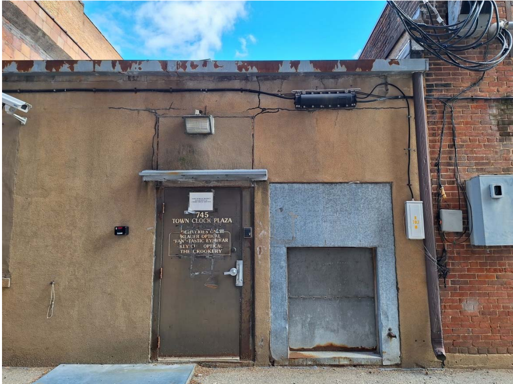
BUILDING EXTERIOR - ALLEY CHUTE OPENING FOR DEMO & INFILL