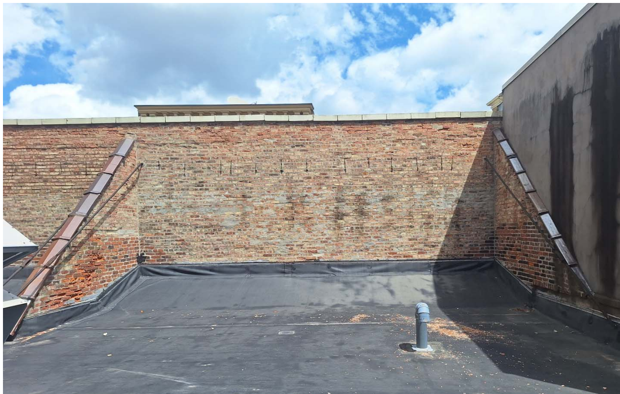
BUILDING EXTERIOR - SOUTH HALF BACK OF FAÇADE WALL