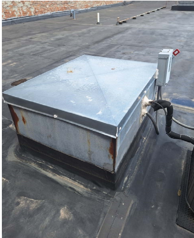
ROOF - EXISTING ROOF CURB FOR DEMO & INFILL