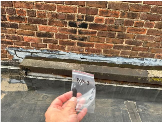
Photo #3 Asbestos containing black tar / sealant on south wall of roof.