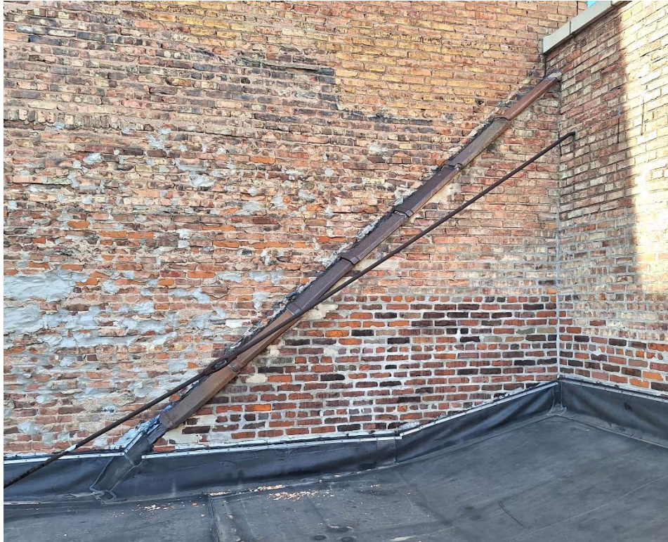
BUILDING EXTERIOR - NORTH BRACE WALL - SEE 2/A1.2