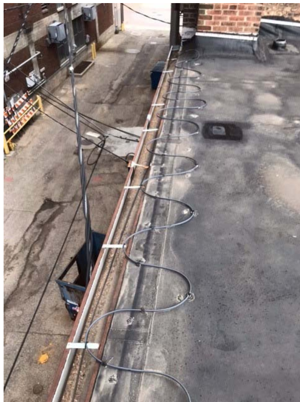
ROOF - EXISTING UPPER GUTTER AND HEAT TRACE AT ALLEY