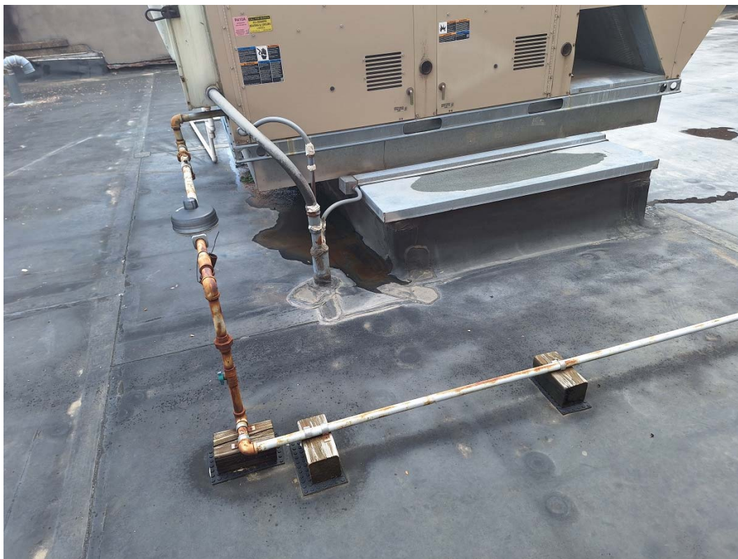
ROOF - EXISTING RTU, CURB, UTILITY LINES & GAS PIPING