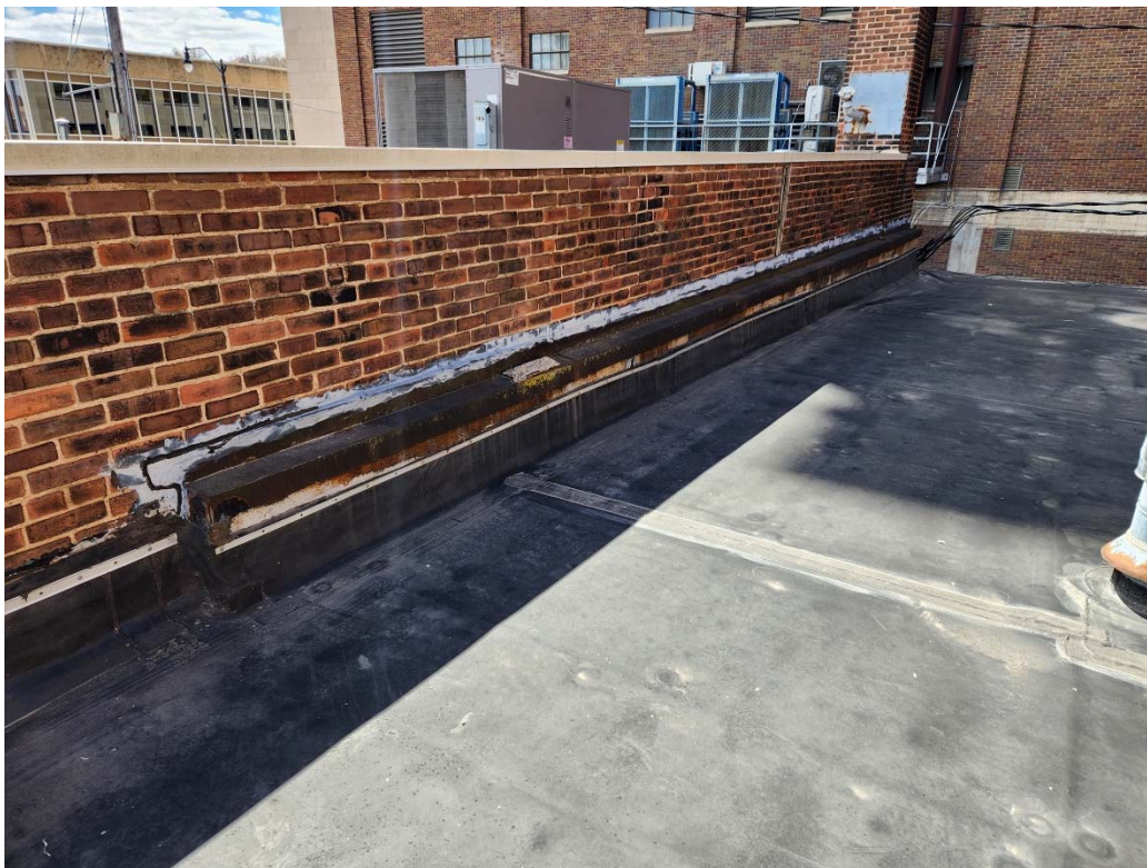
ROOF - EXISTING ROOF CURB AND FLASHING ALONG SOUTH WALL