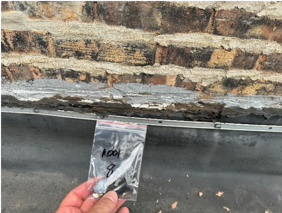
Photo #7 Asbestos containing black tar / sealant on NW wall of roof.

DPP Tuckpointing & Roof Replacement Project ■ Dubuque, IA Date Taken: June 19, 2024 ■ Atlas Project No. 204BS07208