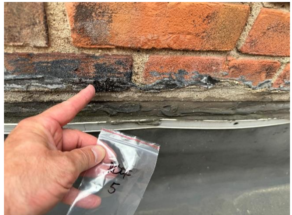
Photo #4 Asbestos containing black tar / sealant on SW wall of roof.