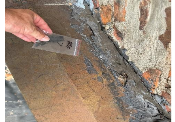
Photo #6 Asbestos containing black tar / sealant on NW wall of roof.