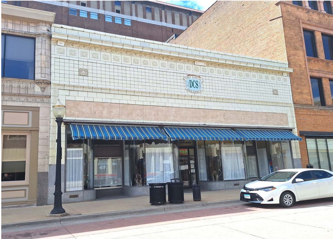
BUILDING EXTERIOR - FRONT EAST WALL