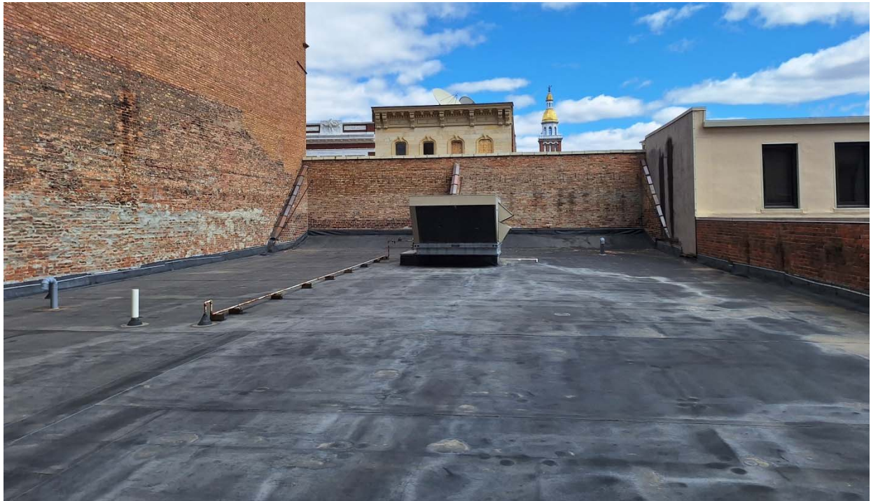
ROOF - EAST HALF LOOKING TOWARD FACADE