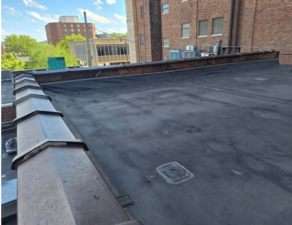
ROOF - UPPER 2ND STORY ROOF LOOKING S.W.