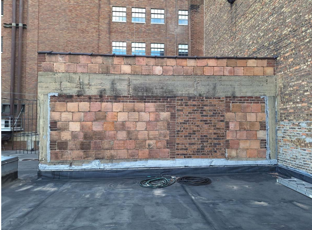
BUILDING EXTERIOR - UPPER EAST WALL