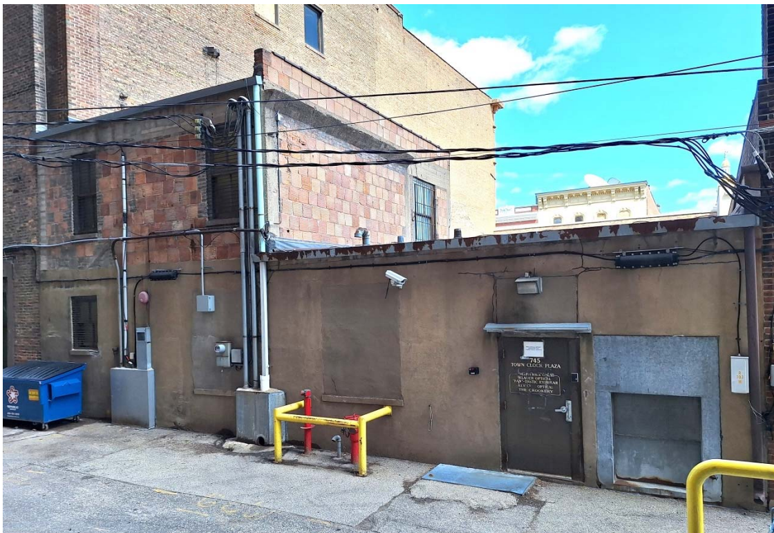
BUILDING EXTERIOR - REAR WEST WALL