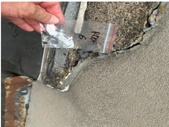
Photo #5 Asbestos containing black tar / sealant on SE wall of roof.