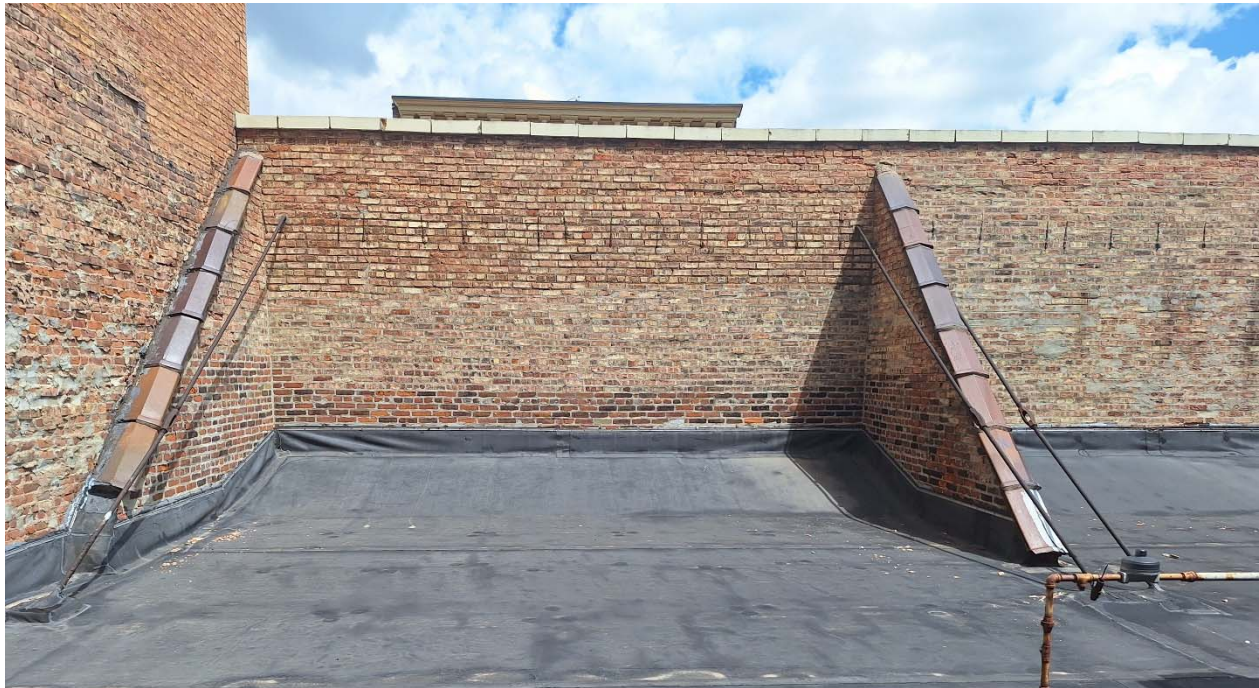
BUILDING EXTERIOR - NORTH HALF BACK OF FAÇADE WALL