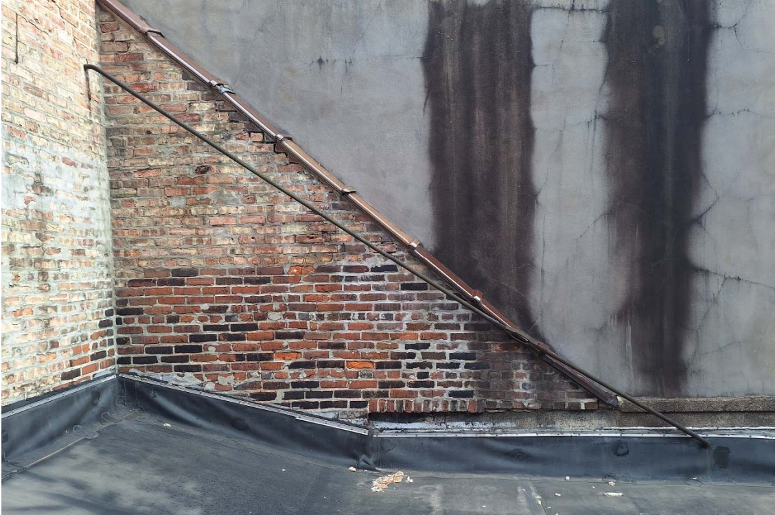
BUILDING EXTERIOR - SOUTH BRACE WALL - SEE 5/A1.2