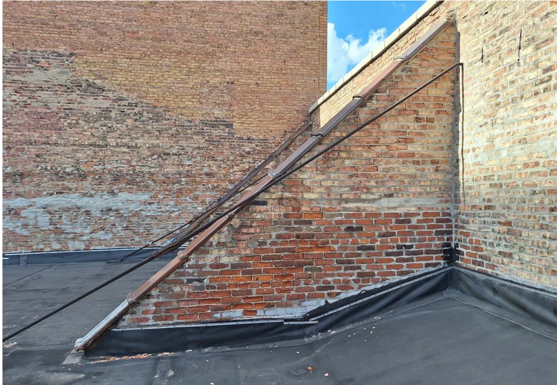
BUILDING EXTERIOR - SOUTH SIDE CENTER BRACE WALL - SEE 4/A1.2