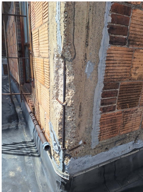
BUILDING EXTERIOR - UPPER STORY CONCRETE REPAIRS ON CORNER