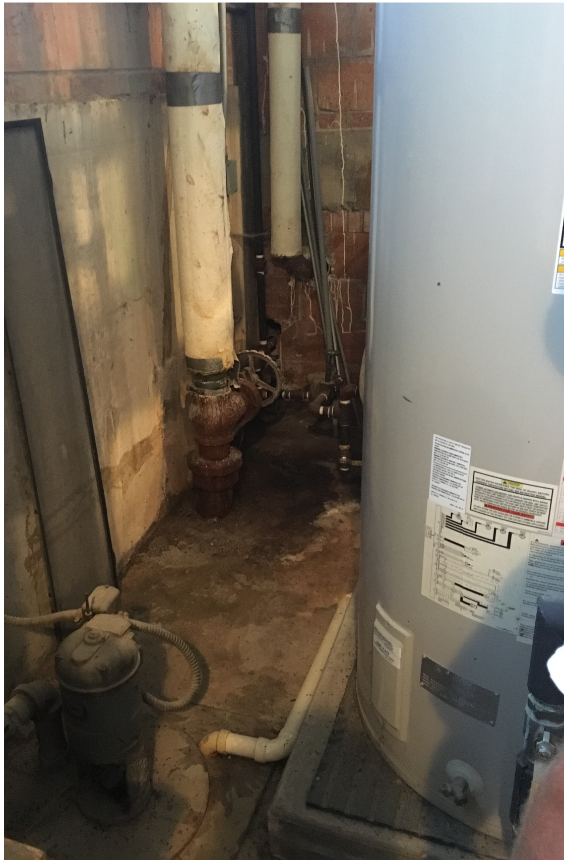
Existing Water Main